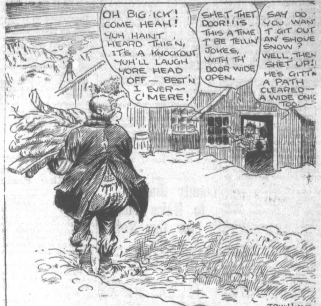
FOOT AND HEAD WORK.