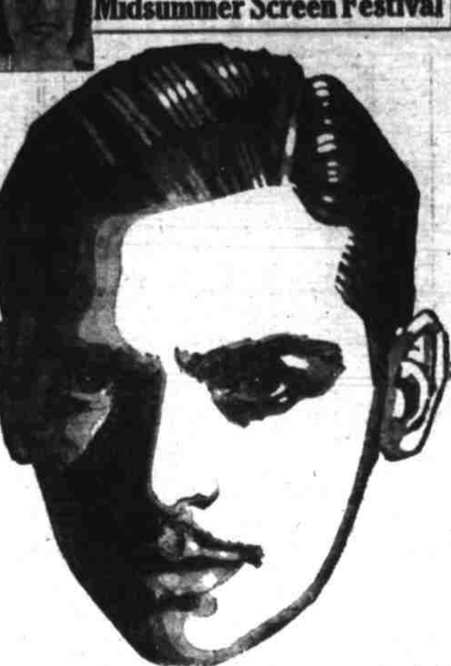
Loretta Young, top, and Douglas Fairbanks, Jr., who have leading roles in "The Life of Jimmy Dolan," feature unit of the R & R Midsummer Screen Festival, playing at Ritz Theatre. Other units are "Noah's Ark," the Silly Symphony that rated four stars in Liberty for July 15th; Mickey Mouse as "The Mail Pilot"; "Krakatoa"; and Paramount News. A richly varied program.

McCamey has made a bid for entering the Eastern division of the West Texas league, it is understood, but not official announcement has yet been made. Odessa is scheduled to play Midland today for the lead. Big Spring will be idle. In the western half of the league, Barstow is leading, with Wink, Pecos and Fort Stockton trailing in the order named.