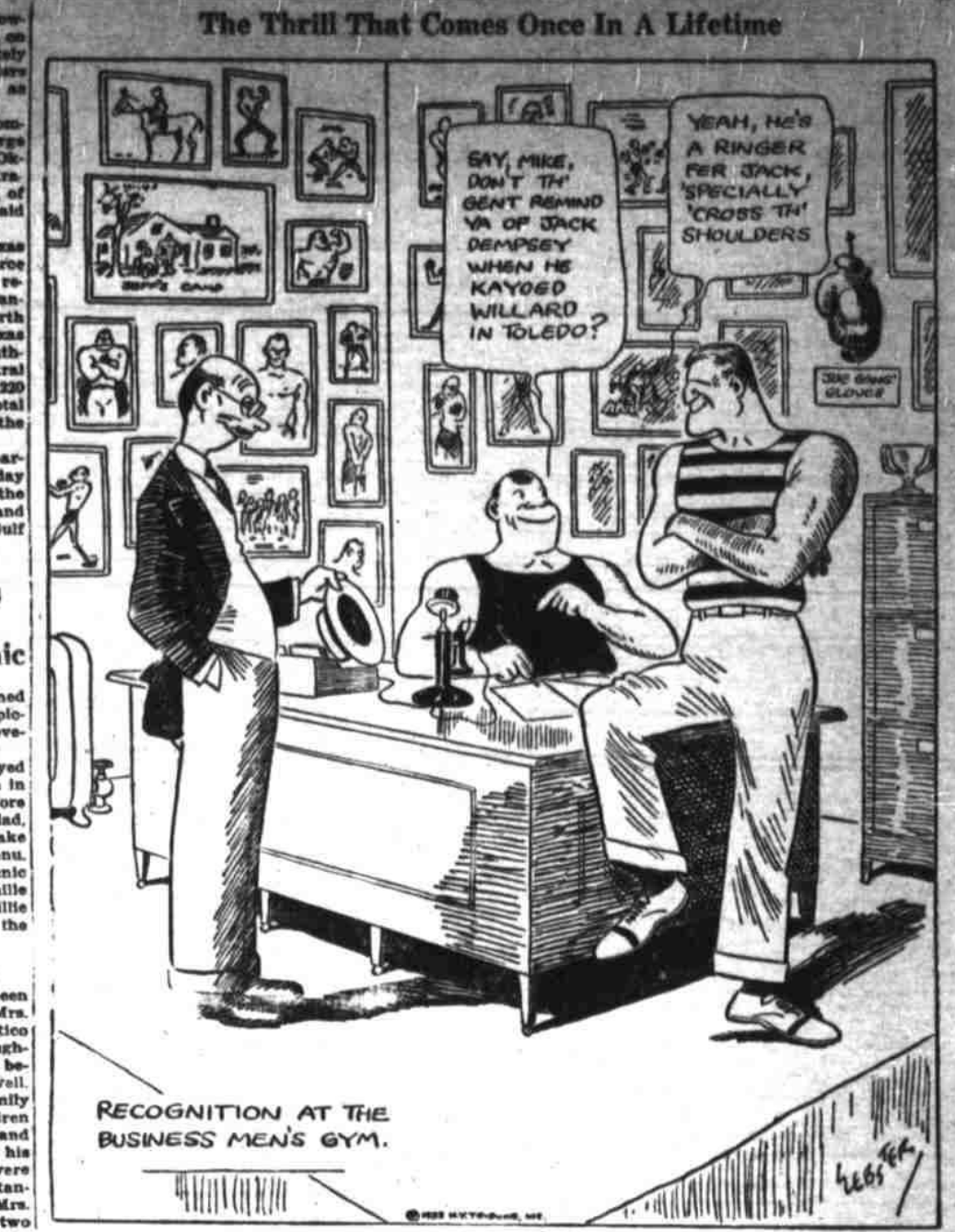
RECOGNITION AT THE BUSINESS MEN'S GYM.