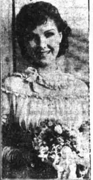
Jean Parker, 17, who kept up with her classes while working in motion pictures, is shown in her graduation dress at Pasadena high school commencement exercises. She expects to continue on to college.