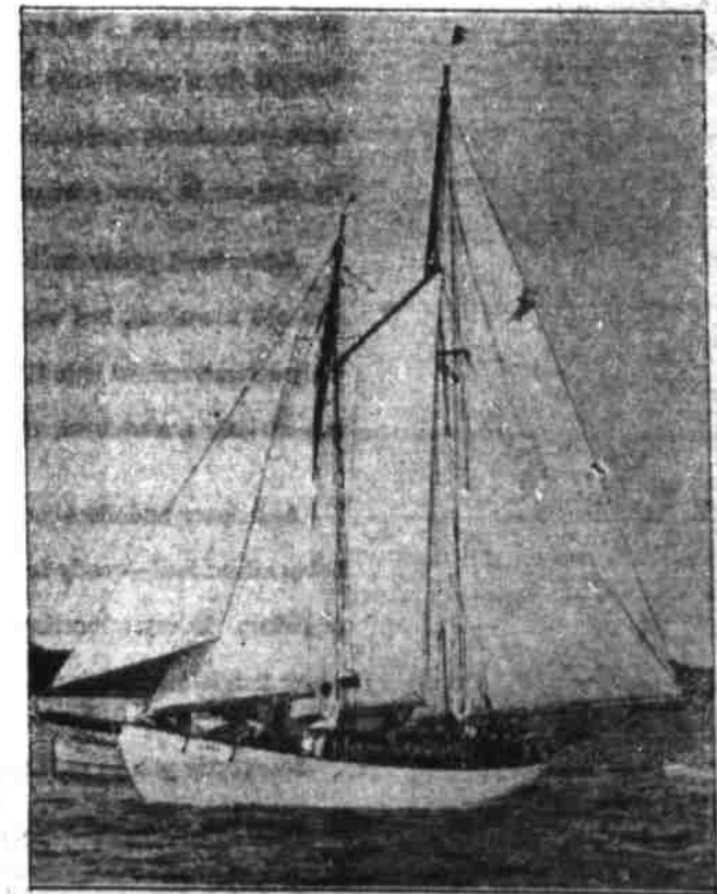
Moving out under full sail the trim saagoing schooner Amberjack II, with President Roosevelt at the helm, heads north for a vacation cruise to Campobello Island just across the border from Maine. A crew of 14 is with the President.