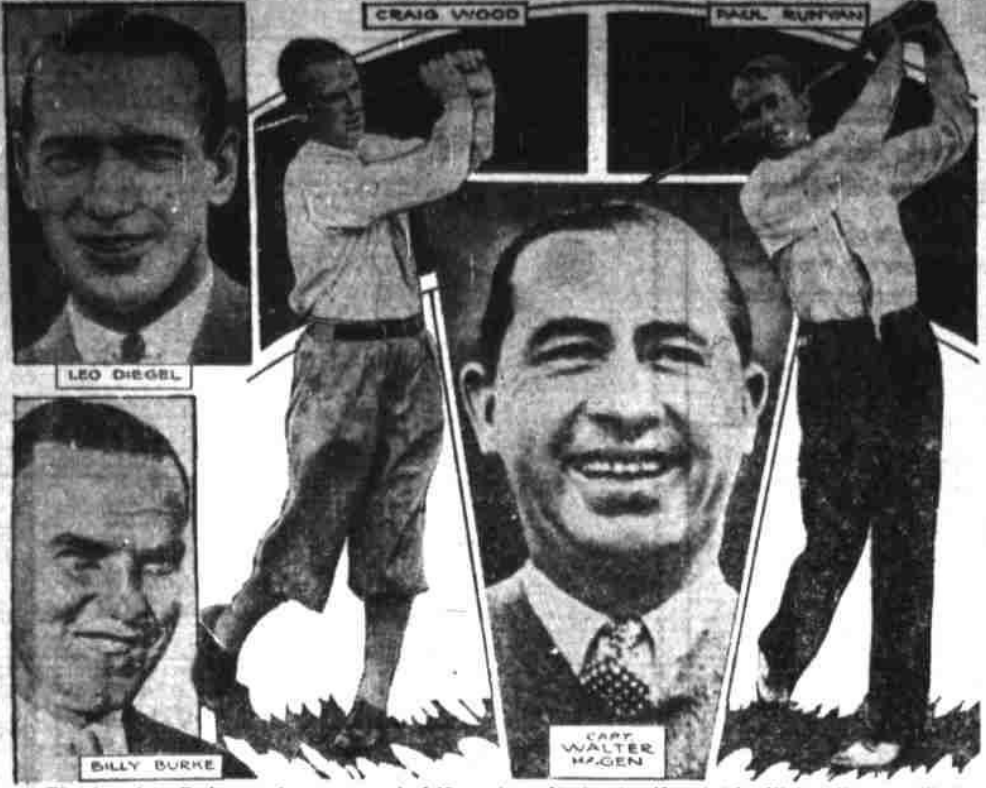
The American Ryder cup team, a squad of 10 crack professional golfers led by Walter Hagen, will play against Great Britain's picked pros in the International series at Southport, England, June 26-27. Here are five members of the American team.