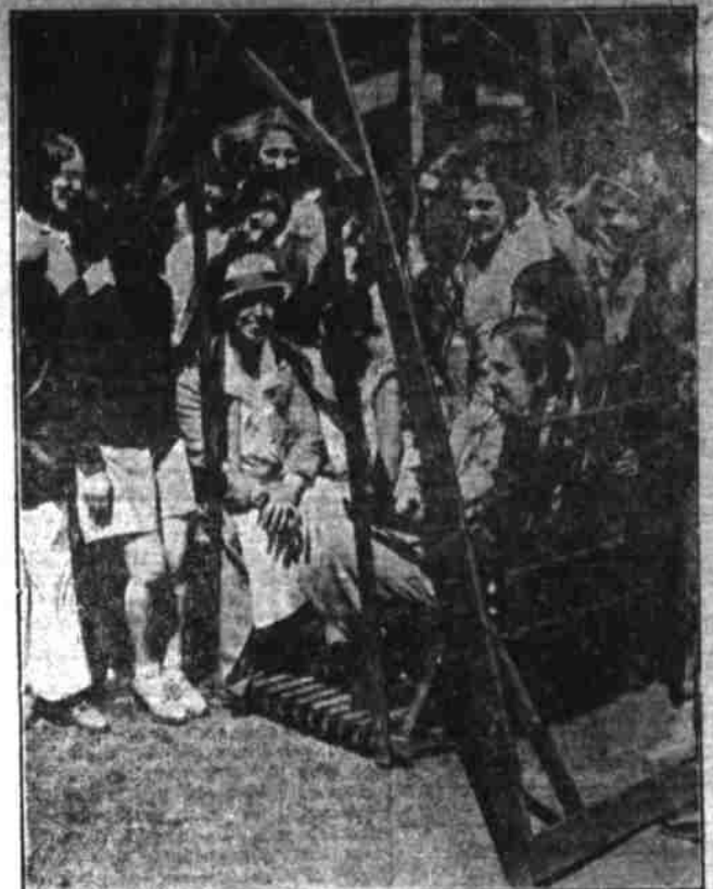
Mrs. Franklin D. Roosevelt is shown with a group of unemployed girls at the New York state relief camp on Lake Tiorati. She took luncheon with the girls and spent about four hours inspecting the place.