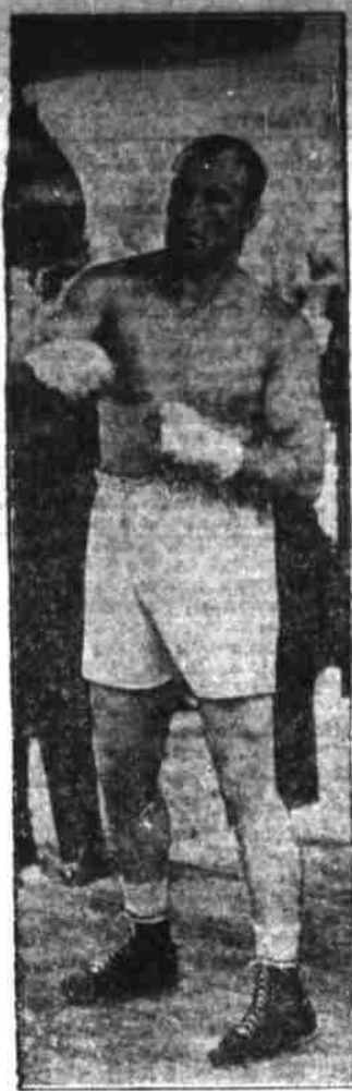
Jack Sharkey is training at Orangeburg, N. J., for defense of his heavyweight title against Primo Carnera in New York June 23.