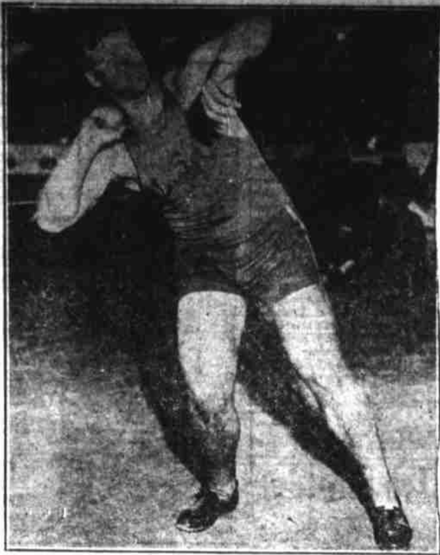
Jack Torrance, 265-pound Louisiana State football and track star topped the world shot put record at the national collegiate meet at Chicago with a put of 52 feet 10 inches.