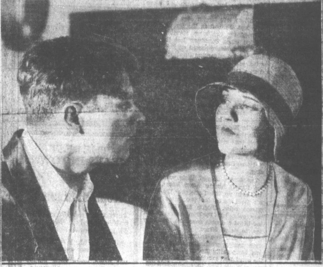
"I came back, Rich, because I thought I ought, I thought you needed me. I thought you would be sarry, and that we would start all over again.

Quietly she heard him out. "I came back, Rich, because I groaned aloud. "There isn't a more miserable man in the world. Don't hate me, conceded me. I thought you would be sorry, and that we would start all over again." "Sorry!" he spaceed. "There isn't a more miserable man in the world. Don't hate me, conceded wearily, "Goodnight, Rich, Do you want to kiss me?" want to kiss you?" he cried. "Of course and flung from the room, hatless, it want to kiss you." I never want to kiss you. I never want to kiss you. I never want to kiss you. I never want to kiss you. I never want to kiss you. I never want to kiss you. I never want to kiss you. I never want to kiss you. I never want to kiss you. I never want to kiss you.