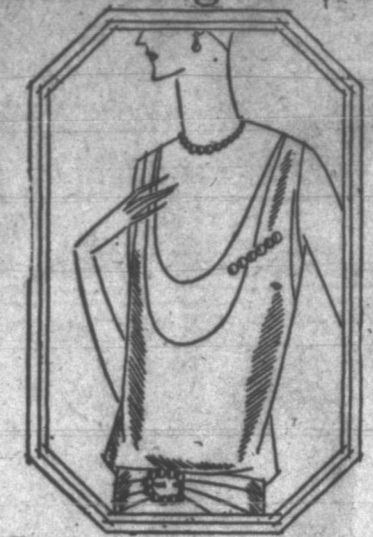
Chanel sponsors matching jewelry—such as this brooch and pin of pearls.

Indorsing the resolution made by the faculty of political science at Columbia University in December, 116 members of the Princeton faculty have called for a reconsideration of the war debt settlement.