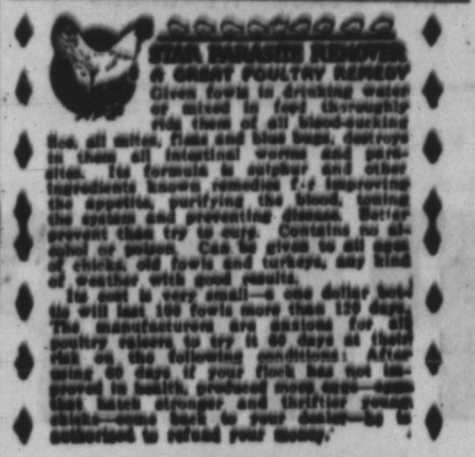
PAMPA DRUG STORE

More than a billion and a half cubic feet of natural gas is used by public utility power plants in Texas as fuel each month—about one-third of all the gas so used in the United States.