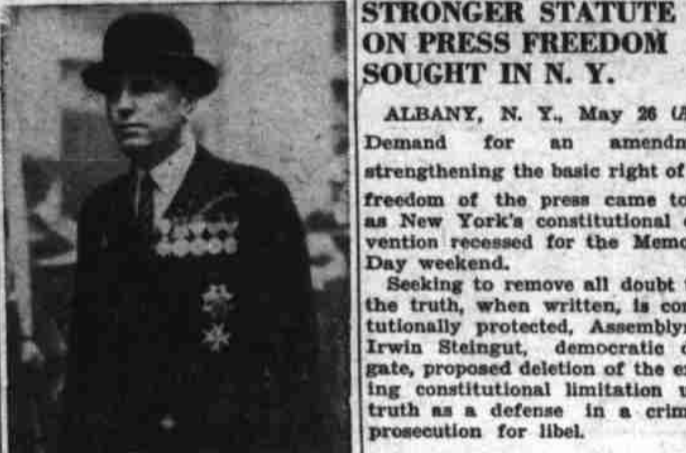
STRONGER STATUTE ON PRESS FREEDOM SOUGHT IN N. Y.