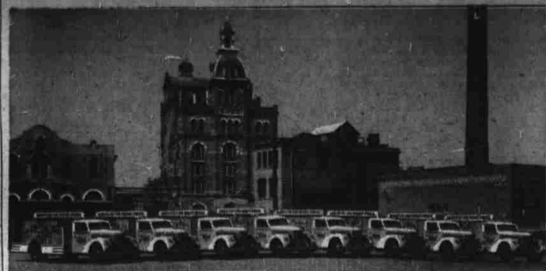
Eight additional delivery trucks, each with a capacity of more than a quarter of a railroad box-car, have been added to the San Antonio Brewing Association's delivery fleet, increasing it to 51, to care for the increased demand this season of Pearl and Texas Pride beers.