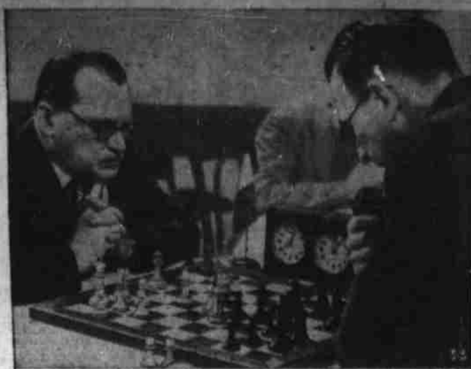
ACTION SHOT of English chess matches shows Champion A. Alekhine (left) concentrating. Clocks time the moves.

TULSA, Okla., May 26 (AP)—Crude oil production figures were away down, the spirits of oil men were proportionately higher, other factors were unchanged relatively and that was about the whole story today in the petroleum industry. Dramatic reductions in allowables made to stem the slump the week before showed their full effect in the output. Over the two-week period the total production was well over 200,000 barrels daily. The Oil and Gas Journal figured a reduction for the week ending May 21 was 176,728 barrels daily, the biggest weekly drop in more than five years. Not since the middle of April in 1933 when the flush East Texas pool was shut down had such a decrease been registered. The immediate effect of the cut was a better feeling on the part of the industry as a whole. Some big purchasers stopped their pipe-