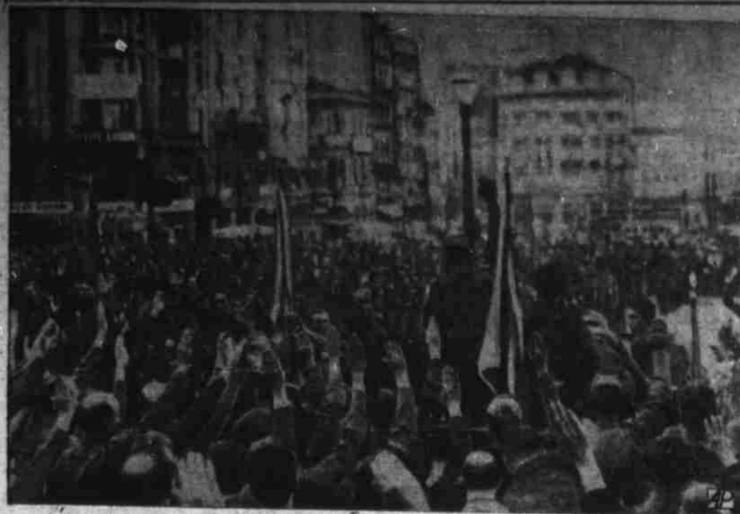
FASCIST GREEN SHIRT RALLIES such as this in Sao Paulo, industrial center, fed the political movement which led to recent bloody attempt by Integralists (or Fascists) to seize Brazilian government at Rio de Janeiro. President Vargas, whose prohibition of Nazi activities aroused German protest, himself helped quell Green Shirts revolt, shooting plotters from palace window. Whether Vargas, who assumed authoritarian powers last November, can keep a whip hand over a million and a half Italians—mostly Fascist—and 200,000 Germans in Brazil, time will tell.