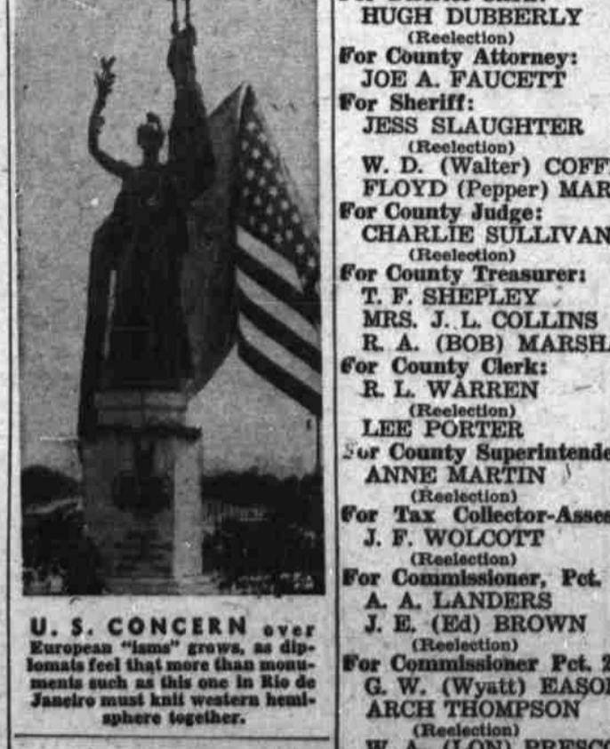
U. S. CONCERN over European "isms" grows, as diplomats feel that more than monuments such as this one in Rio de Janeiro must knit western hemisphere together.

WAR medals worn by Lord Wakehurst, governor of New South Wales since 1937, in Sydney's Anzac day parade, reminded spectators of his valor in world war action.