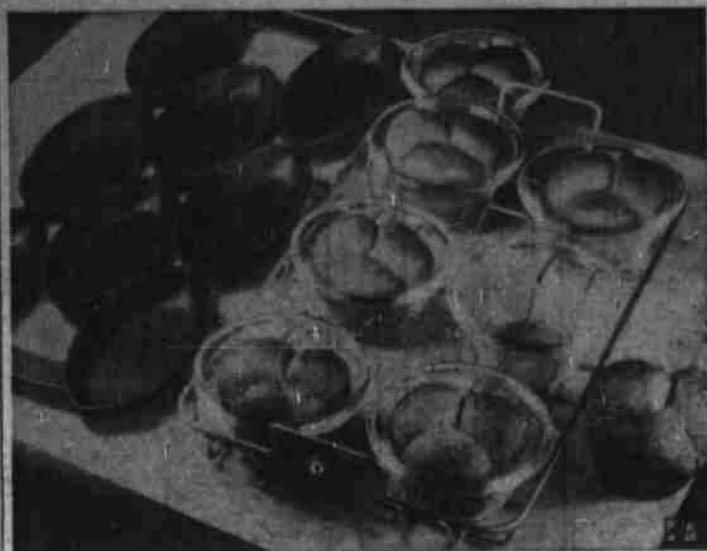
GLASS AGE SUCCEEDS IRON Grandmother's cast iron gem pans have given way to glass mugs or custard cups in convenient racks in the modern bride's kitchen.