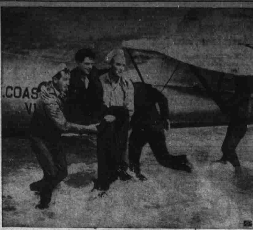
CRASH OF PLANE INTO BAY not far from Floyd Bennett field, New York, injured three of the five pilots in the monoplane and led to their rescue by coast guardsmen in an amphibian. Above, one of the five is carried ashore by the guards. The monoplane had crashed from 400 feet, and an alarm was turned in by a naval officer flying nearby, toward Bennett field.