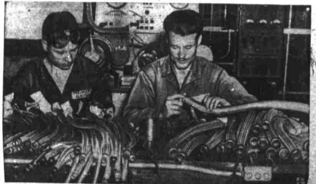
RATIO OF SEVEN TO ONE —To keep one plane aloft at Randolph Field, Texas, seven highly trained mechanics work on ground jobs—as these fellows are. They're running ignition wiring through metal housings, for otherwise interference would render useless the sensitive radio receiver. More than 300 planes are in daily use at this U. S. army air base.