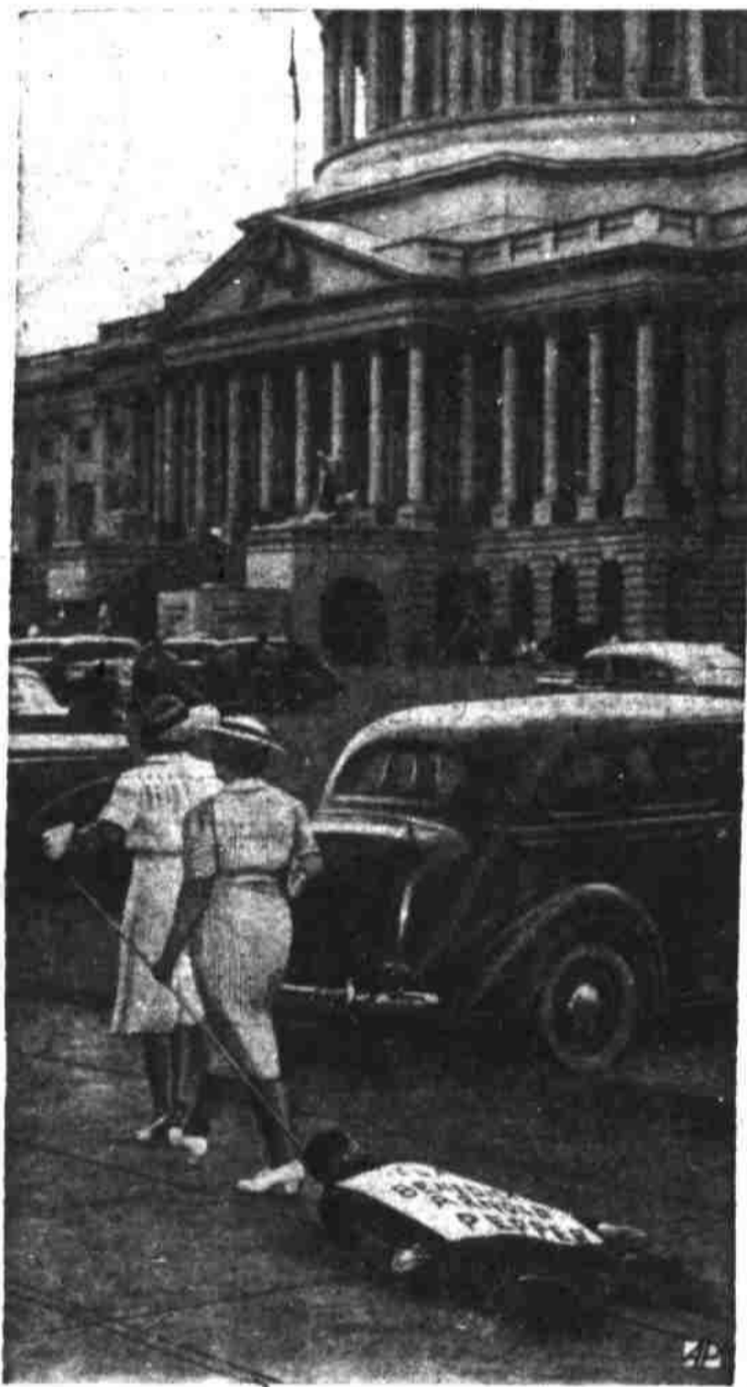
SEASONED WITH PEPPER —Through Washington streets this effigy of Sen. Claude Pepper, Florida Democrat supporting compulsory military training, was dragged by women who said they represented the Congress of Mothers of U. S. A., opposing a draft. They managed to hang the effigy briefly from a capitol tree. Dummy was marked "Claude Benedict Arnold Pepper."