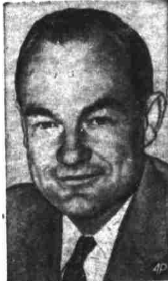
FARM MAN —Successor to Henry A. Wallace in the cabinet, as secretary of agriculture, is Claude R. Wickard (above), 47, Indiana-born farm leader. He has been active in the affairs of the Agricultural Adjustment Administration.