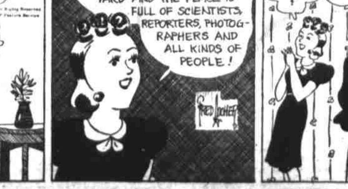
IT IS FUNNY I-I WAS JUST JURED ALIVE HERE—NOTHING EVER HAPPENS...