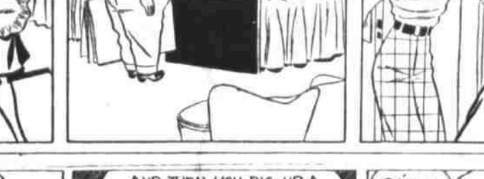
ISN'T IT EXCITING! FOEY! WE'RE READY NOW, MRS. HOOPEE!