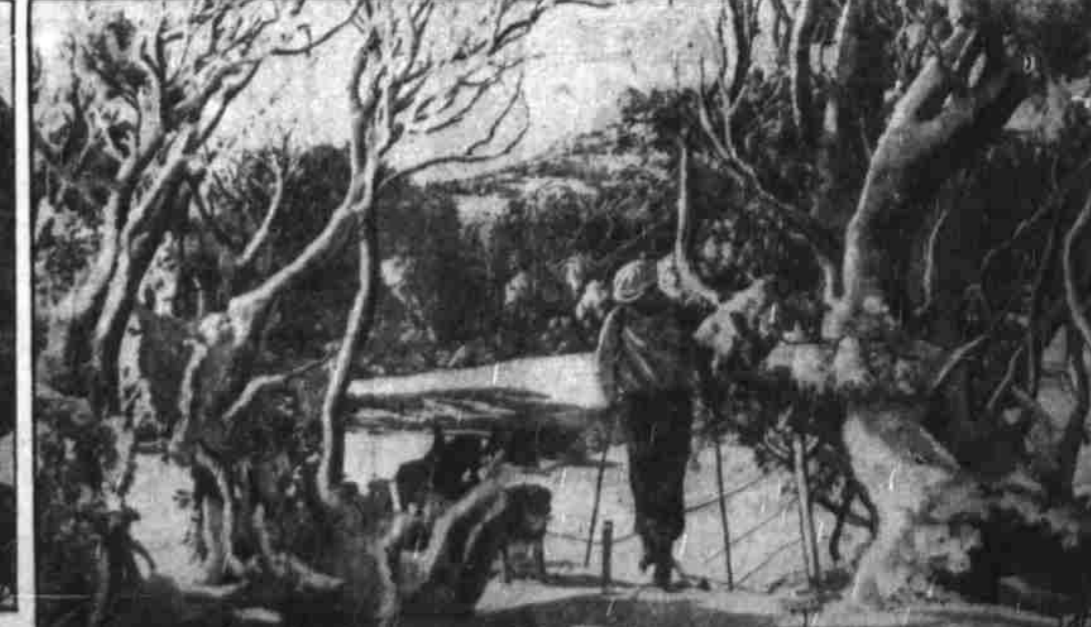
SPRING'S COMING HERE. Down under in Australia they're waiting for the robins and crocuses as snow blankets much of the landscape. It's winter in New South Wales. This cooling scene is on the slopes of Mt. Kosciuszko where they're skiing while the northern hemisphere sweats under a summer sun and waits for autumn to bring relief.