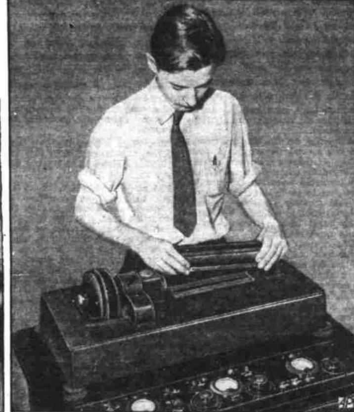
MINIATURE MARVEL. Plugged into a wall-socket just like an electric toaster and connected by telephone wire to its control point, this compact machine is ready to receive newspictures from over the nation. It's the new, small Wirephoto receiver, part of the equipment used to speed important pictures to this newspaper.