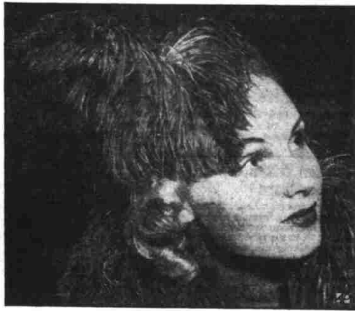
GIBSON GIRL, 1937 MODEL. Reverting to the luxury era of the gay '90's, millinery creators designed this headdress of fuchsia ostrich for evening wear. Fine feathers, streamlined to fit the times, will again be sported by American womanhood this fall, stylists predict.