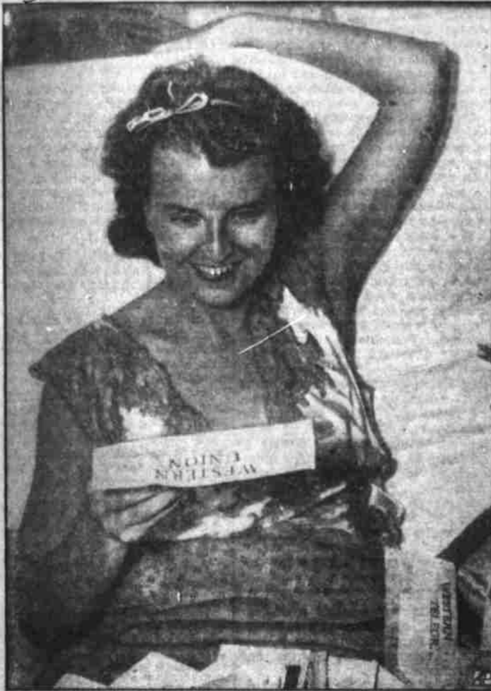
SWEET NOTES FOR SINGER. Marion Talley, operatic soprano, convalescing in Los Angeles from a recent appendectomy, reads the wishes of some of her fans for a speedy recovery. She planned to go to her Kansas farm to recover fully before resuming her broadcast work in Hollywood.