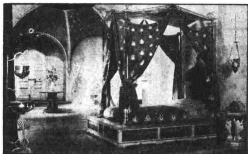
JULIET'S BRIDAL CHAMBER