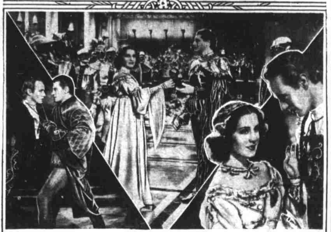
Norma Shearer, Leslie Howard, Ralph Forbes in "Romeo and Juliet"

One of the major events of the local show world will be the screening, at the Ritz Tuesday and Wednesday, at popular prices, of the film version of the immortal "Romeo and Juliet," the romance penned by the greatest dramatist of them all and made into a photoplay that has been hailed as a masterpiece.