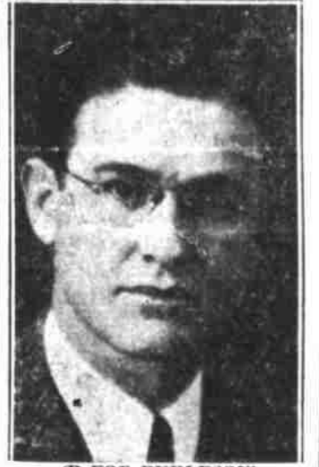
B. FOR BURLESON

The war was on in full swing this morning as the campaign for the next district governor of Lions 2-T waged in hotel lobbies and on the streets.