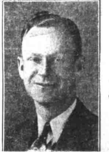
T. FOR POND

Slogans graced the backs, hats and coat lapels of the delegates and the Burleson booster's campaign signs of "B for Burley" were counteracted with those of Colorado, "P for Pond to Drown Burley in!"