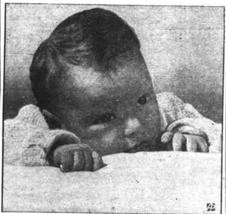
A BREAK FOR BABY Needy mothers and babies have a friend in the federal children's bureau which is seeking to improve their lot through the Social Security Act.