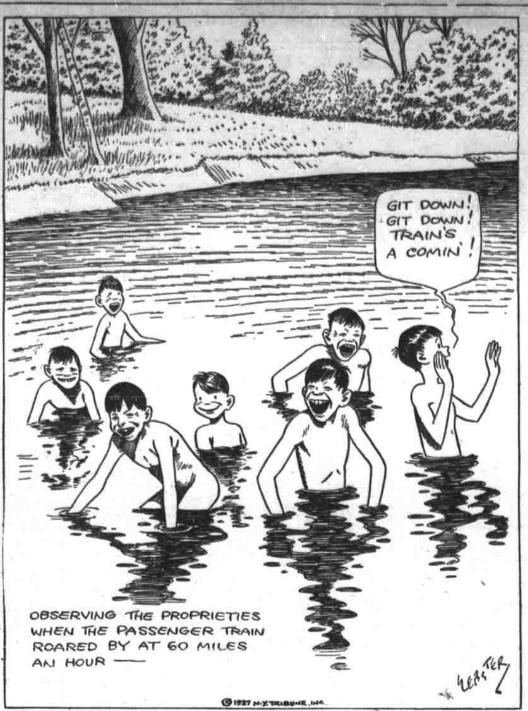
OBSERVING THE PROPRIETIES WHEN THE PASSENGER TRAIN ROARED BY AT 60 MILES AN HOUR