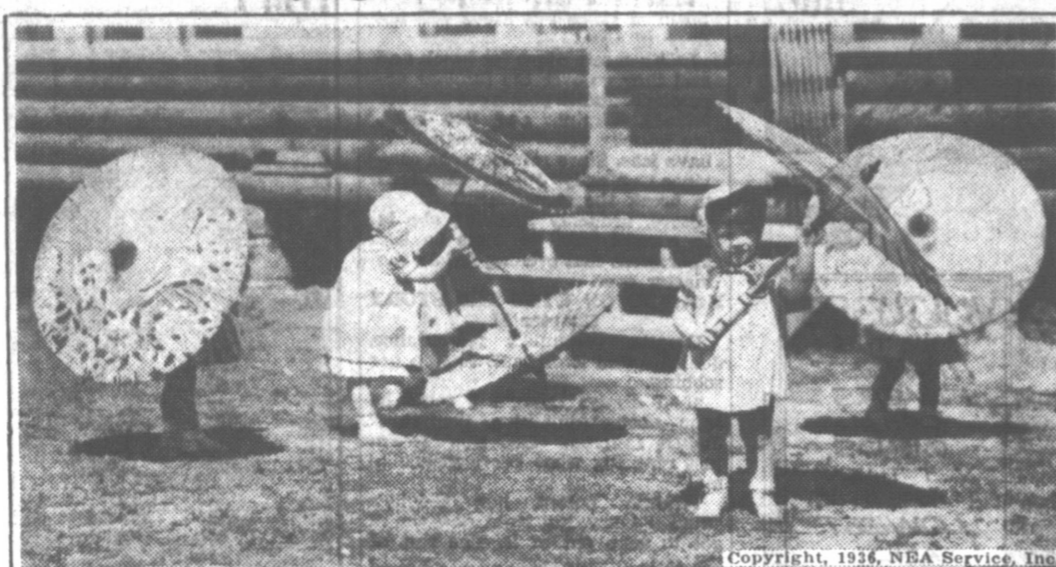
A new game of peek-a-boo with the smiling summer sun held the stage before the quintuplets' nursery when the babies were given brightly colored parasols which opened out magically! Annette, at left, is all but hidden behind hers. Cecile (Pat! Your slip is showing!) turns her parasol upside down to see just what it's made of, and almost obscures Emilie, beyond. Yvonne, in foreground, poses prettily, not allowing the shadow to darken her smile. Who's hiding back there at the right? Marie, with only her sturdy little legs peering out.