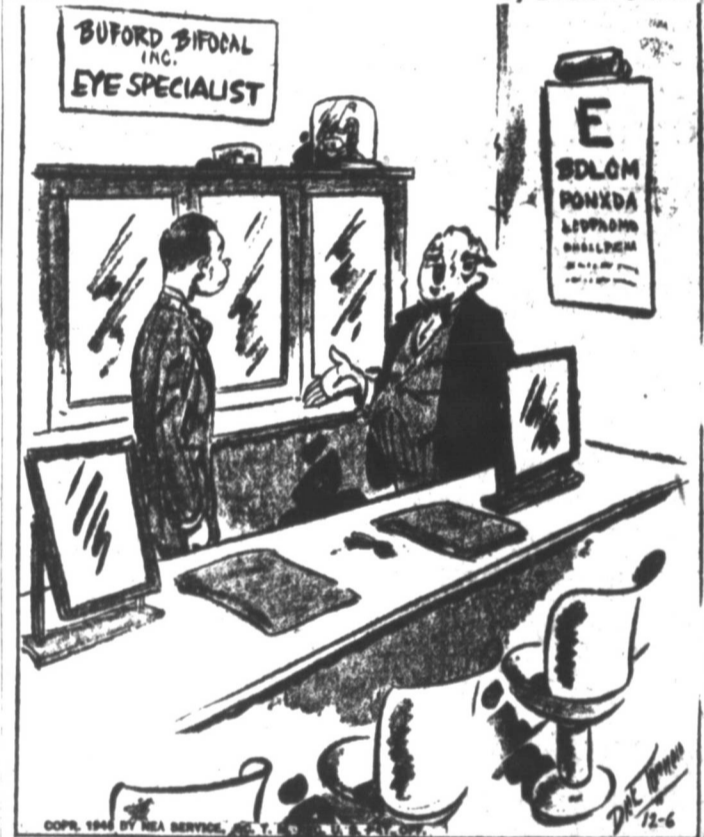
"I'm sorry business doesn't warrant keeping you any longer, Hodgins! Keep in touch though—it may pick up when skirts get shorter!"