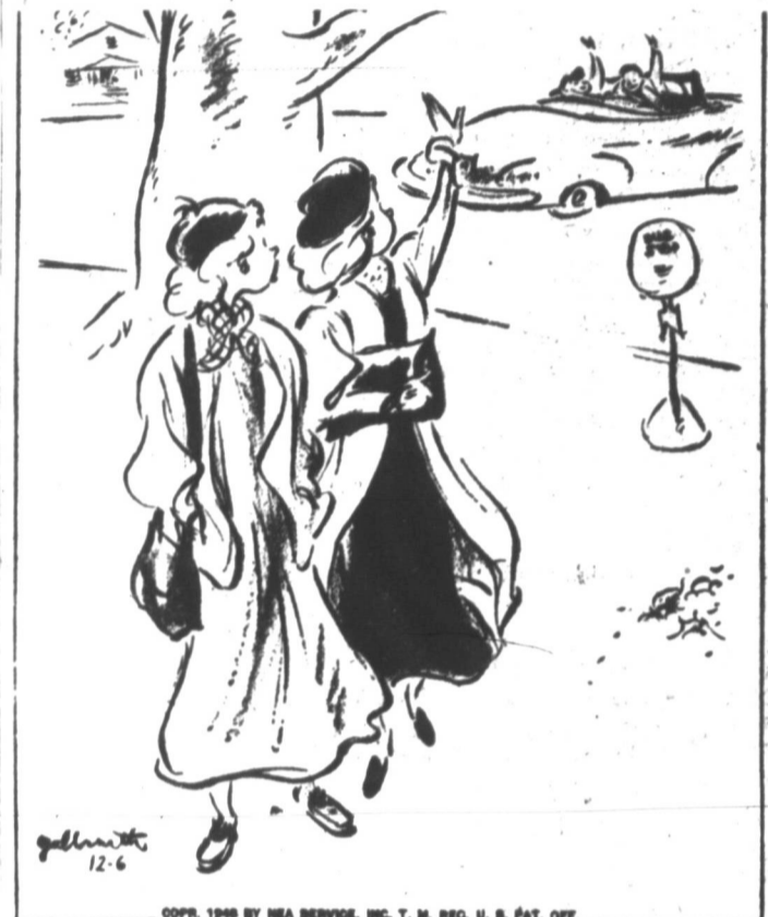
"I was sort of engaged to him last summer, but when he fell for that dizzy sophomore and her convertible, I couldn't stand him!"