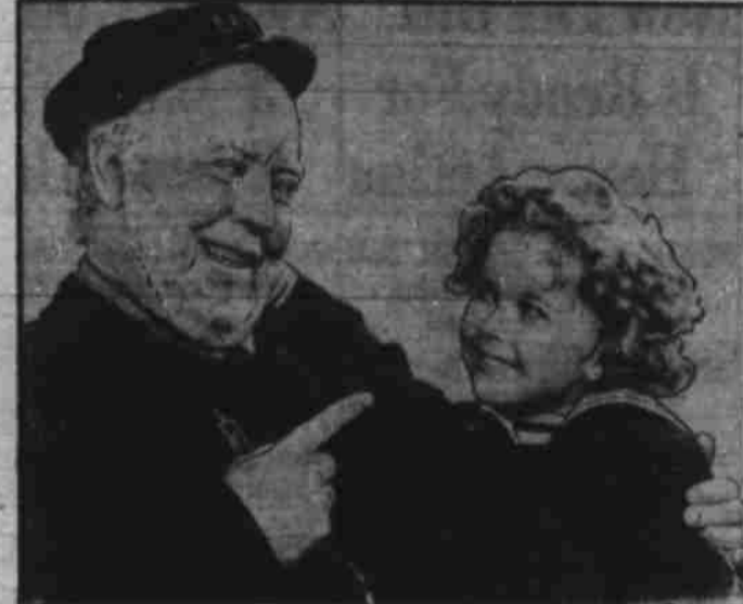
Guy Kibbee and Shirley Temple in a scene from Shirley Temple's latest starring vehicle, "Captain January," featured Sunday and Monday at the Ritz. It is a story of how a little waif, rescued at sea, brightens the life of a grizzled old sea-salt.