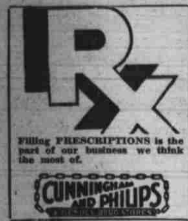
Filling PRESCRIPTIONS is the best of our business we think the most of.

"Transatlantic Merry-Go-Round" a sparkling comedy drama with melody, mystery and romance, staged aboard an ocean liner, is the Queen theater's feature for Sunday, Monday and Tuesday. The cast is headed by Jack Benny, radio's favorite who also is popular in the movies. Nancy Carroll