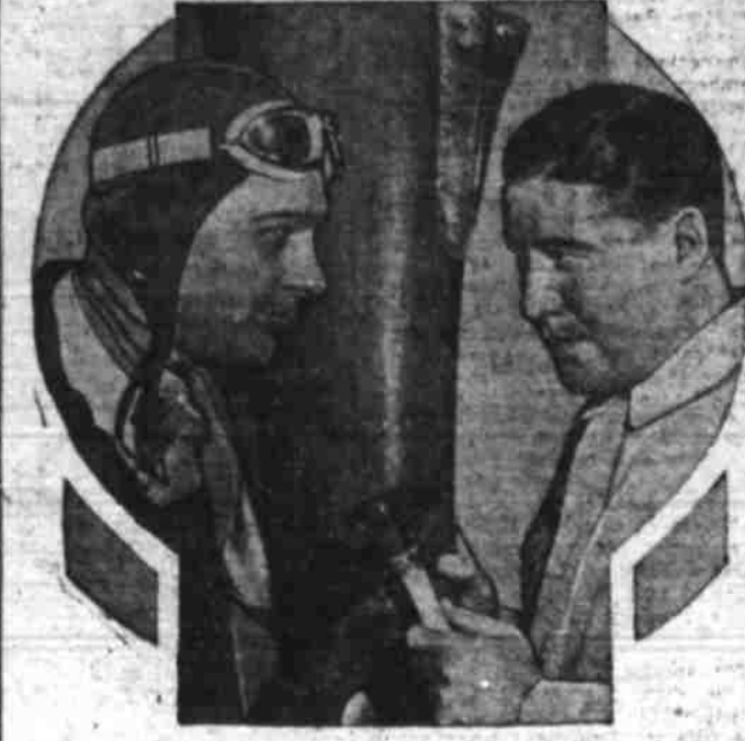
Thursday of this week at the R. & E. Ritz "Sky Bride" will be featured. Above you see Richard Arlen and Stuart Erwin in a scene of the picture.