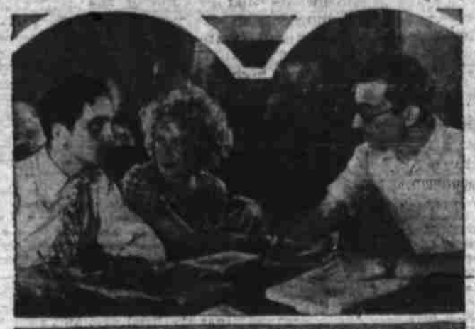
Frederic March, Miriam Hopkins and the director, Rouben Mamoulian, are seen above in a picture taken during filming of "Dr. Jekyll and Mr. Hyde" in which March has the leading role. It will be at the R. & E. Ritz today and Monday.