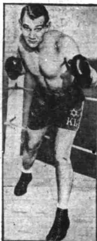
Fancy nicknames may fly almost as fast as heavyweight fists when Micky Walker (left), the "toy bulldog" from Rumson, N. J., clashes with Chicago's King Levinsky in a ten-round bout at the Chicago Stadium April 29. These two are ranked among leading contenders for Max Baer's title.