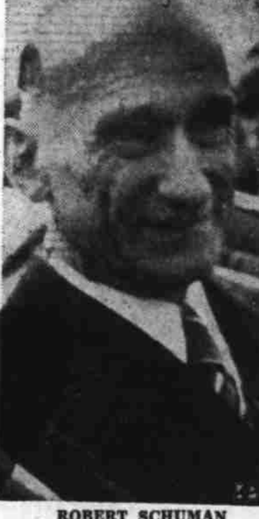
ROBERT SCHUMAN . . . plunges into task