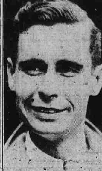
An unnamed aviator came out of the Amazon jungles with the story that Paul Redfern was alive, the captive of a savage tribe. Redfern has been missing for five years since he left Brunswick, Ga., for an attempt to fly to Brazil.