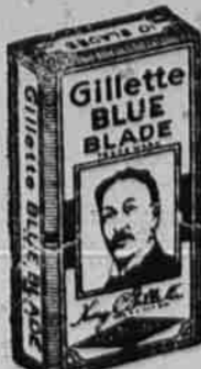
No package contains genuine "BLUE BLADES" unless it carries the portrait of King C. Gillette.

Incredible as this may seem—"BLUE BLADE" edges actually will cut glass. Hundreds of shavers accepted our recent invitation to prove this by test. Here is positive evidence of the "BLUE BLADE'S" amazing quality.