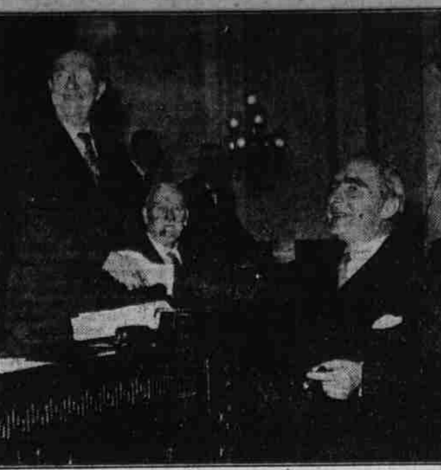
Ogden L. Mills (right), secretary of the treasury, is shown shaking hands with Rep. James W. Collier, chairman of the house ways and means committee, when the former appeared before the committee to testify regarding revenue possibilities of the Collier beer bill.

daddies and the nurse maids of proration. They pleaded in the beginning for control of production, basing their plea on the argument that proper control would stabilize the market, creating a price level that would allow producer, refiner, and marketer alike to make a fair profit.