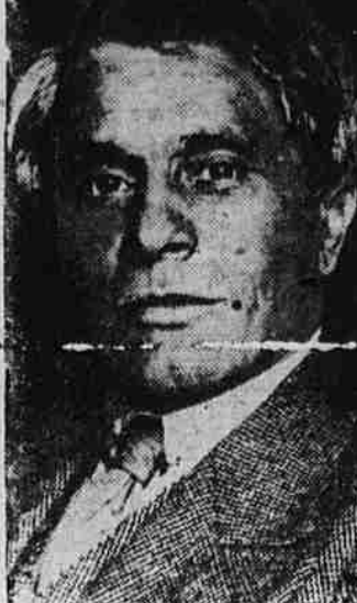
Joseph Paul-Bonheur, minister of war in Herriot government and veteran of French politics, was asked to form his cabinet forming a new cabinet to face the French debt crisis and succeeded.