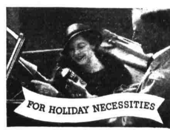
Be prepared. Forestall annoyances that may mar your trip. Shop with Gulf.