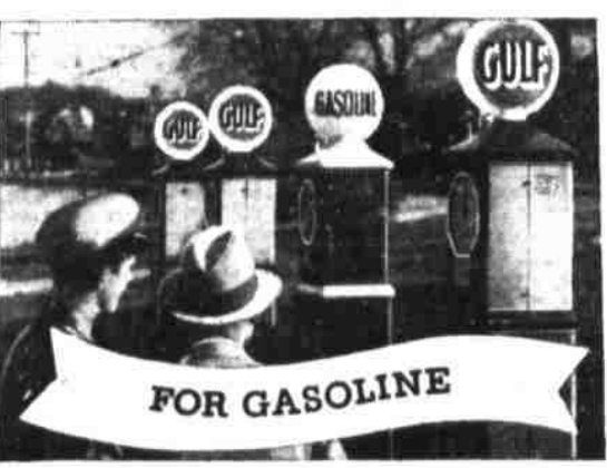
Take your pick of Gulf gasolines. Lubricated gas? Certainly!-That Good Gulf!