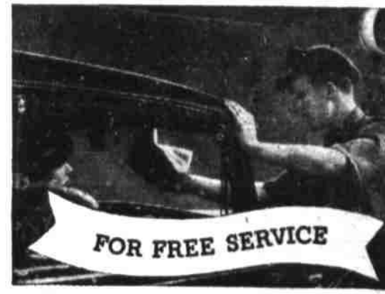
These Gulf services are free: Clean windshield, fill radiator, inflate tires, check oil.

WF EVER there was a week-end to drive into a Gulf station __this is it!