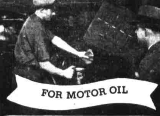
Under the Gulf banner are 4 great motor oils -each an amazing value!