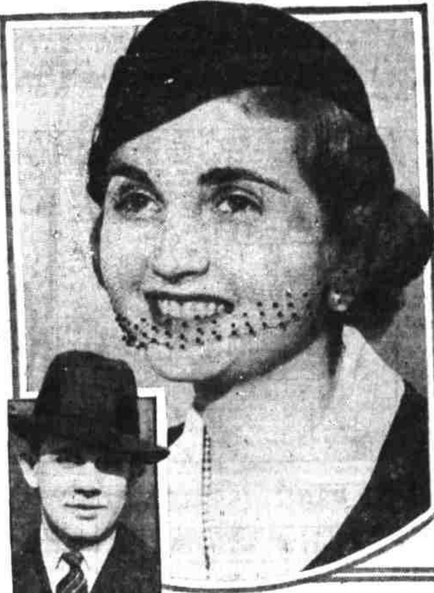
The engagement of Barbara Hutton, granddaughter of the late F. W. Woolworth, to Prince Alexis Mdvanl, scion of Georgian nobility, was formally announced in Paris. The wedding will be in Paris about June 20. Miss Hutton's fortune represents one third of the Woolworth estate, estimated at $58,000,000 at the time the chain store founder died.