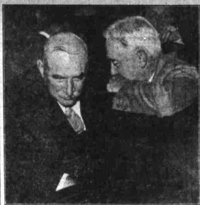
J. P. Morgan, America's mysterious financier, revealed himself as a calm, genial, soft-spoken man as he bared long hidden secrets before a senate committee investigating the vast international banking houses which bears his name. These pictures show him entering and leaving the hearing and conferring with John W. Davis, his counsel.