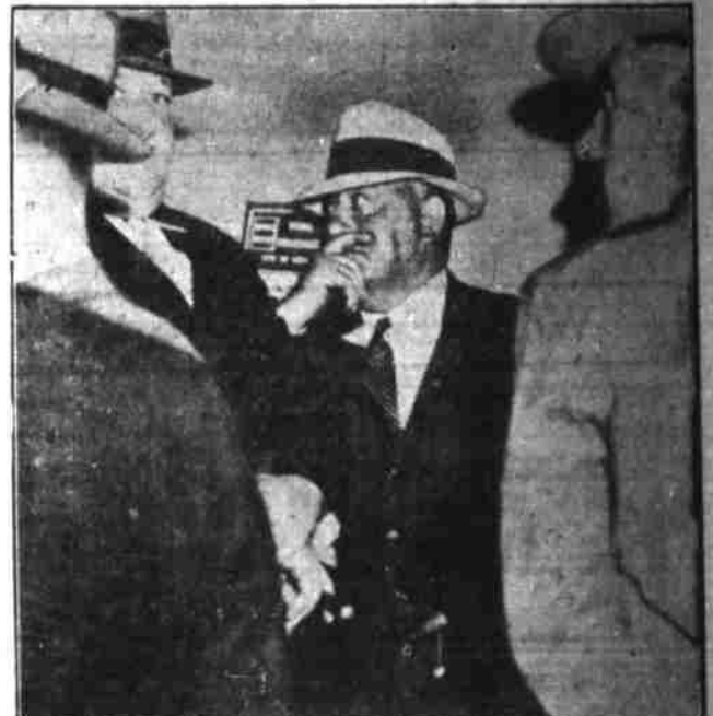
Waxey Gordon (center), captured in his hideaway near White Plains, N. Y., was returned to New York to face charges of evading the federal income tax. He is shown at New York police headquarters. Gordon, one of the few remaining gang chiefs in the New York metropolitan area, had been missing since April 12.