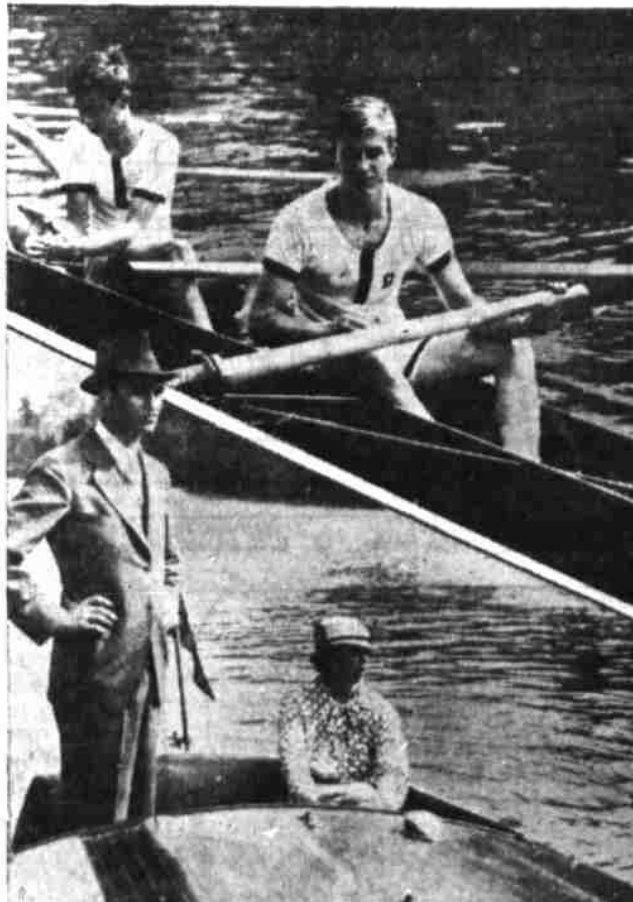
Following the race from an official launch, Mrs. Roosevelt saw a Groton crew captained and stroked by her third son, Franklin, Jr., win by two lengths in a race with Belmont Hill school on the Nashua river near Groton, Mass. Franklin is shown above at his oar. Below are Mrs. Roosevelt and her son James.