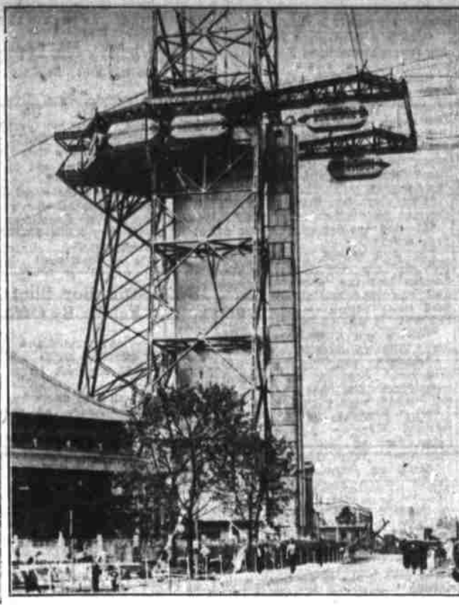
This is one station of the "Skyride" at the Chicago world's fair, showing how specially built rocket cars pull up for passengers at the 200-foot level. Each car holds 32 passengers, and travels on cables above a lagoon at another station on an island.