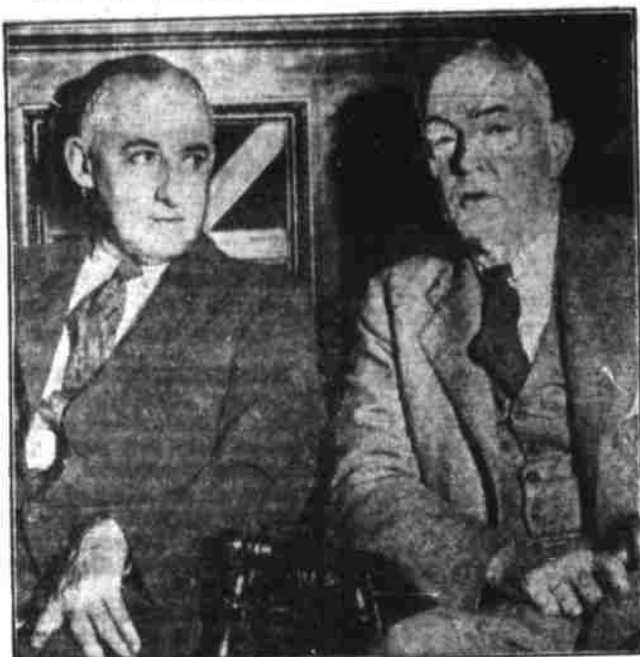
Steps necessary to stamp out organized crime were discussed at the hearing of the senate sub-committee on racketeering in New York.