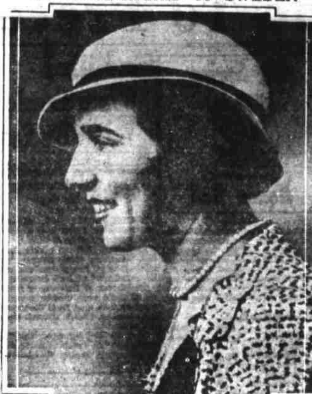
Here is a recent informal portrait of Princess Ingrid of Sweden.

radio team will play Stanton, here. Last Saturday Stanton had the Mexican Tigers of Big Spring played on the local grounds, and the score was 3 to 0 in favor of Stanton.