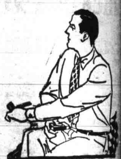
FINE SHIRTS AT $1.50 to $4.50

We're showing a complete selection of these high grade suits in models for men and young men; blue serges, fine worsteds and cassimeres in solid colors and new striped and checked patterns. Real values are featured at $27.50, $30, $35 and $40; others range upward to $55.