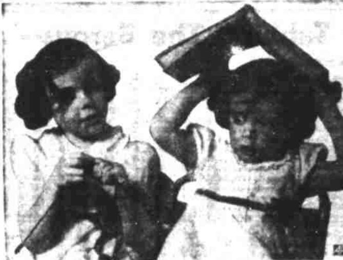
SEEMING WAS BELIEVING —So impressed was Princess Birgitta, second daughter of Sweden's Prince Gustaf, with a fairy tale that she re-enacted it, while her sister, Margaretha, kept on knitting, during this play hour at Stockholm.