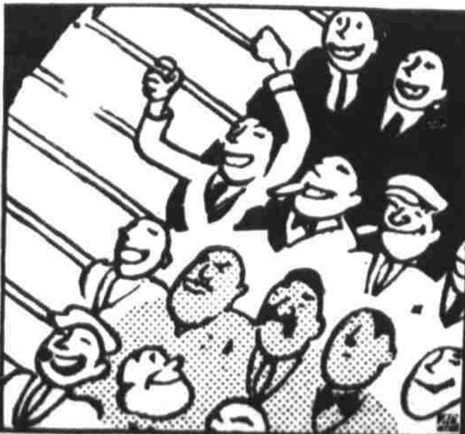
LOOK WHO'S HERE! —Thanks to a waggish artist in the Post of New York Authority office, three European dignitaries settle among the bleacher fans on a baseball schedule cover. Left to right are Mussolini, Josef Stalin and A. Hitler.