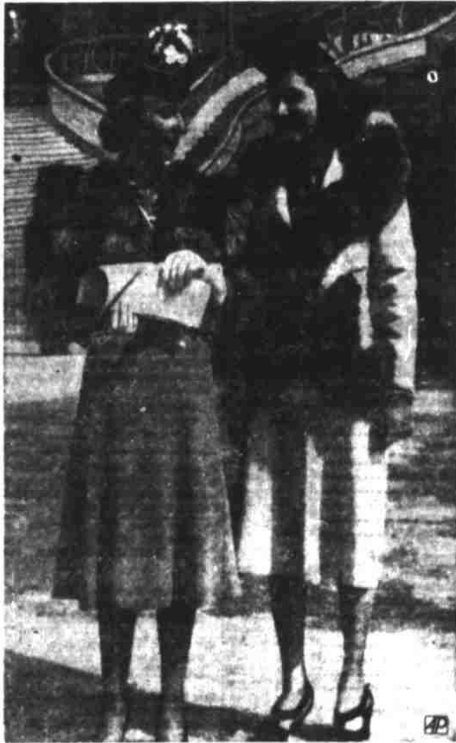
MODISH PARISIENNES —War or no war, a horse race brings out style-conscious French girls. These were at Longchamps.