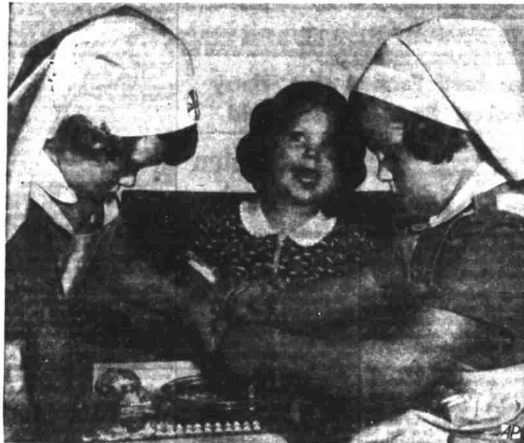
SHE PROBABLY DOESN'T LIKE TO COOK —While her two sisters tend busily to the cake they're mixing at Haga palace in Stockholm, Sweden, Princess Desiree rolls her eyes at the cameraman. These three, Birgitta (left), Margaretha (right) and Desiree, are daughters of Prince Gustaf and Princess Sibylla of Sweden. This was in their playroom.