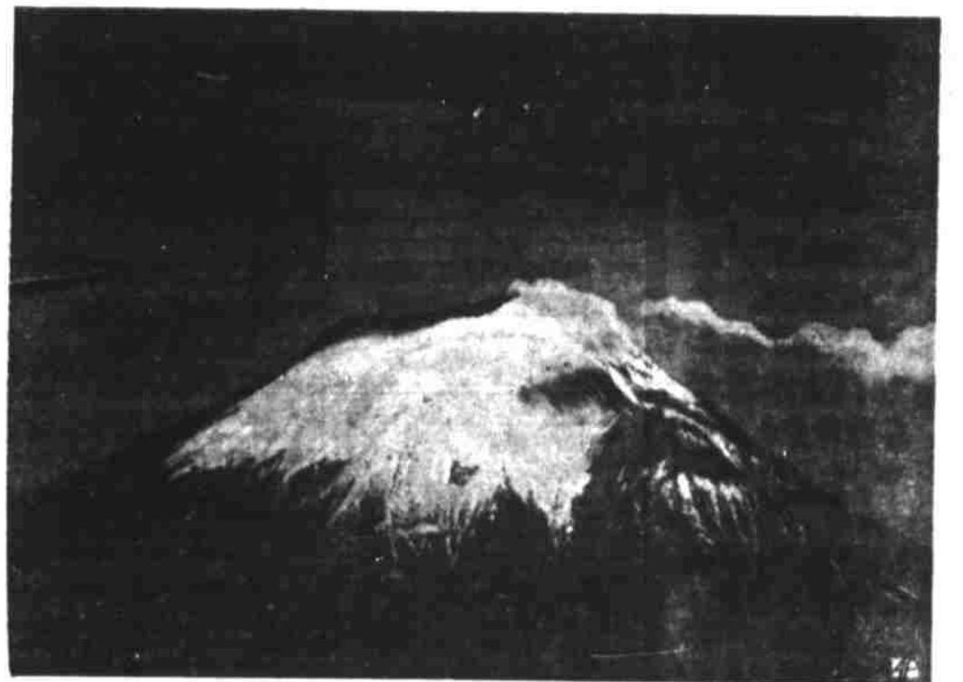
RARE VIEW OF SLEEPING GIANT —Slumbering Mt. Popocatepetl, Mexico's famous volcano, is seen from height of 18,000 feet in view made by Mexican army fliers.