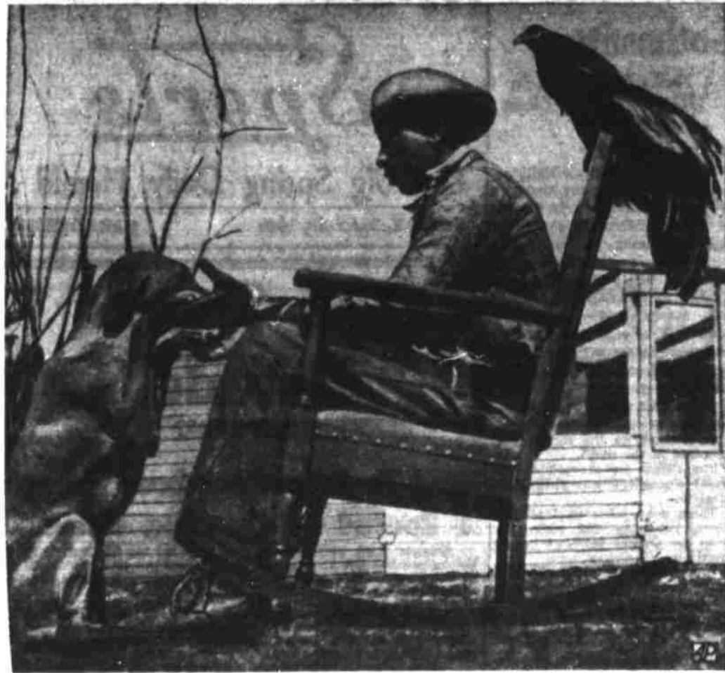
ROCK-A-BYE FOR FIGHTING COCKS —Rockin' chair really "gets" the Negro worker on cock-training farm near Dallas, Tex., but the chair is part of his job. The bird is placed on the back of the rocker so that it will learn balance as the chair rocks to and fro. The birds are bred and trained near Dallas for fights elsewhere, since Texas bans cock fights.