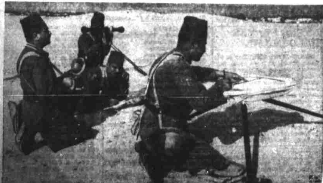
EGYPT EYES HER ARMY —With war interest shifting Mediterranean-ward, Egypt measures her military strength, counting on soldiers like these at an observation post in S-