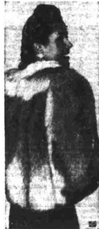
FOXY FURS —Valued at $4,000, this collarless hip-length spring jacket designed by Dein-Bacher has four platina fox skins worked together to emphasize spine line markings. Reverse treatment in sleeves eliminates abrupt shoulders.