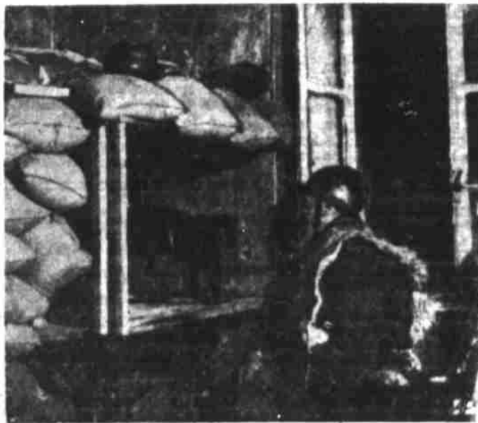
NO PLACE LIKE HOME —Thus does Mars alter the looks of a French villager's living room. This is a machine gun nest.