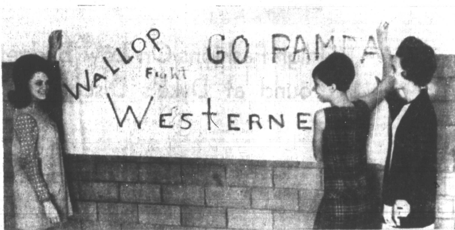
GETTING READY — Members of the Pampa High School student body prepare the football team and school for Friday night's district playoff game with Lub-