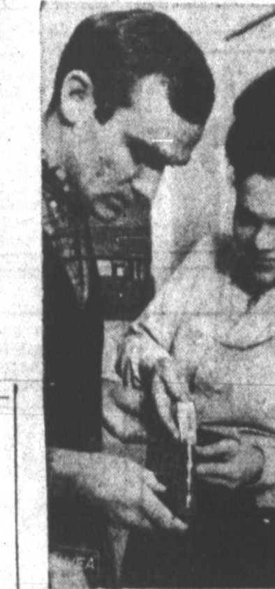
SHREWD HOMEMAKER gets helping hand for work around the kitchen. Installing racks for lightweight utensils, pots or decorative accessories is easier when done with adhesives. Just touch on the glue and secure in place. Most units will hold without use of clamps or weights.

cars in. They are surrounded by boxes of books, tools, sports equipment and junk no one could decide to throw away. It saves bruised shins and frustration at not finding what you want to clear out the stuff now.