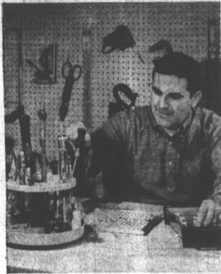
REVOLVING STORAGE UNITS hold many tools and small parts for do-it-yourself activities and home repairs. The tool caddies also take up a minimum space and help clear garage and workbench clutter.

By AILEEN SNOODY NEA Home Editor NEW YORK—(NEA) It's time to think about getting organized and to do something about it before warm weather lethargy takes over.