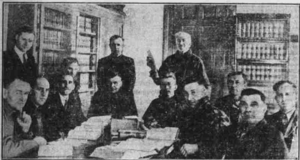
Farm leaders in Iowa and South Dakota have organized a "council of defense" to block mortgage foreclosures. The council is shown in session in Le Mars, Ia., scene of a recent demonstration by several hundred farmers to prevent foreclosure of a farm.