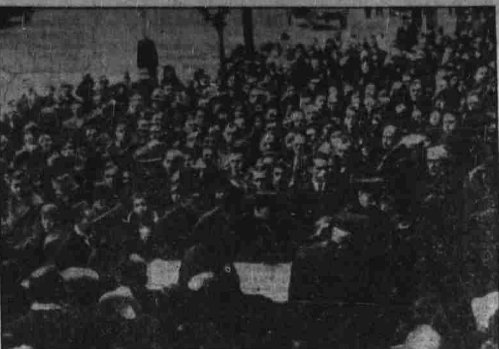
This Associated Press telephoto shows soldiers carrying the body of former President Calvin Coolidge into the Edwards Congregational church at Northampton, Mass., as crowds jammed the street in front of the church.