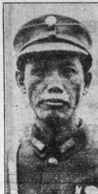
Gen. Teal Ting-Kai, whose leadership against the Japanese at Shanghai made him a hero in China a year ago, now has asked for a chance to lead his Chinese troops against the Japanese in Shanhai-kwan.