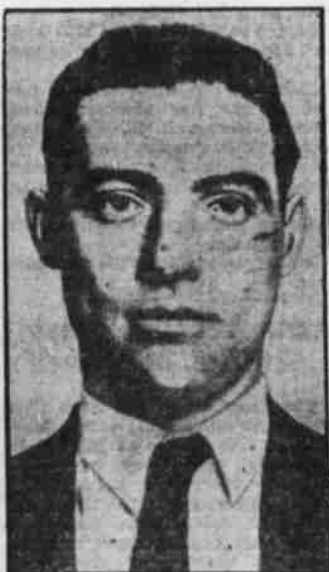
The body of Ted Newberry (above), for years a dominating figure in Chicago's gangland and an ally of the Capones, was found filled with shotgun shells near Chesterton, Ind.