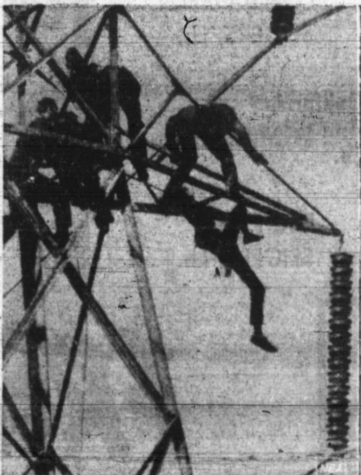
DARING RESCUE of a paralyzed youth on a power pole was brought off by four death-defying Los Angeles city firemen. Brian Latasa, 17, had climbed the 30-foot pole, touched a wire, was catapulted into the air and fell across a 50,000-volt line. Paralyzed, he was able to move only his eyelids.

PASADENA, Calif. (UPI)—Pictures taken by the latest U.S. moon satellite, Surveyor 6, show a moonscape littered with rocks ranging in size up to two feet wide which may have been spewed from a crater out of camera range. A spokesman for Jet Propulsion Laboratory said the rock-strewed Central Bay region looked like "a boulder field," but added scientists were unsure how the rocks got there. One guess is the rocks were hurled from an unseen crater "from over the horizon, where no crater is visible."