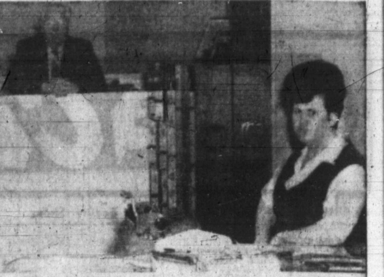
H. W. WATERS Insurance Agency, 123 W. Kingsmill, specializes in writing the hard-to-get insurance for the low-priced dwellings. A quick phone call to MO 5-2331 will enable you to be brought up to date on all the latest coverage offered to the citizens of Pampa.