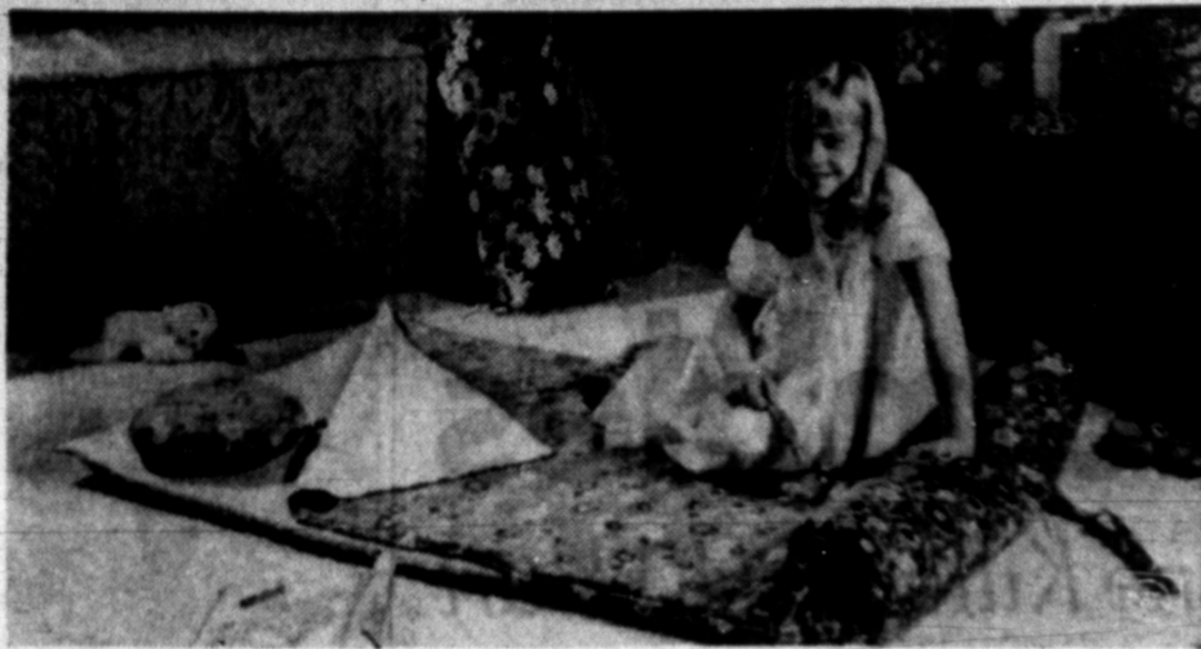
FLOWERED VINYL IN wide-awake shades of hot pink, acid green, purple and white makes the outside covering of a slumber tote. Same pattern in sturdy cotton forms the lining. Softness is provided by pad of latex foam rubber. It's a cinch to make, for a travelin' teen