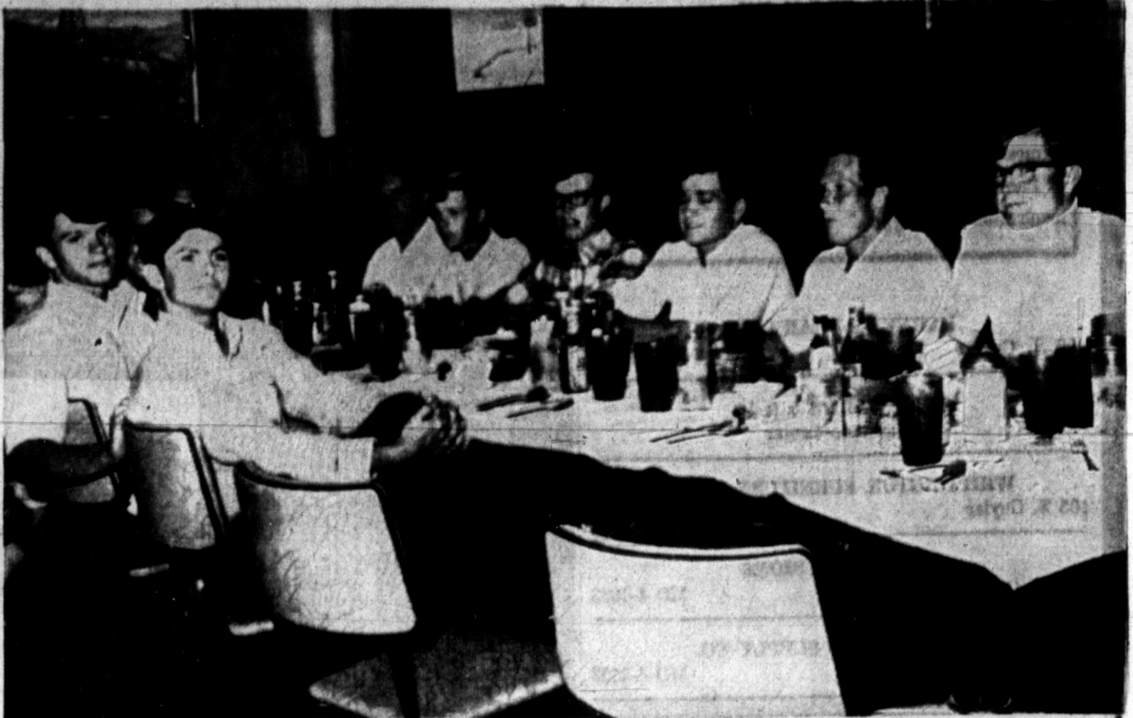
REBELS HONORED —Members of the Pampa Rebels American Legion baseball team were honored by their coach and the Pampa Legion Thursday night with a steak banquet. The Rebels won the District 8 baseball title with a 16-2 record and play Wednesday night in the regional tournament in Amarillo. Their opponent has not been named.

There are several other Pampa and Panhandle area dragsters who will compete in the stock car eliminations.