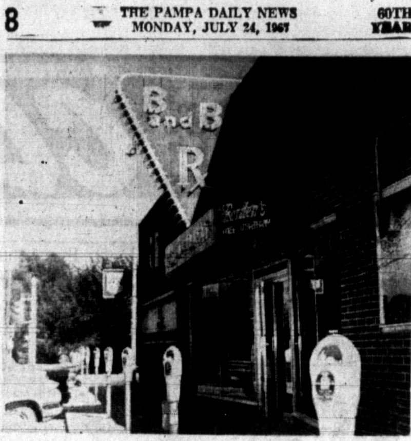
FREE DELIVERY is available to all B & B Pharmacy customers that find themselves needing the product right away or are at home without transportation. Call MO 5-3788 and they'll do their best to please you.