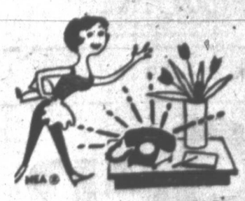
Everyone appreciates a phone call before a friend drops in.