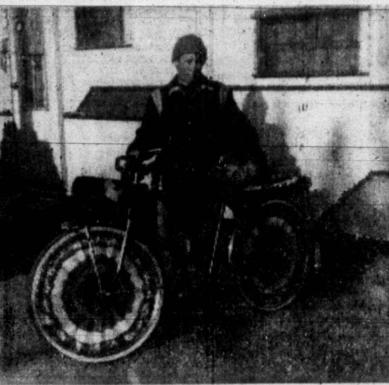
icate for his first place bicycle. One of the largest crowds in recent years lined the parade route to welcome Santa Claus to Pampa.