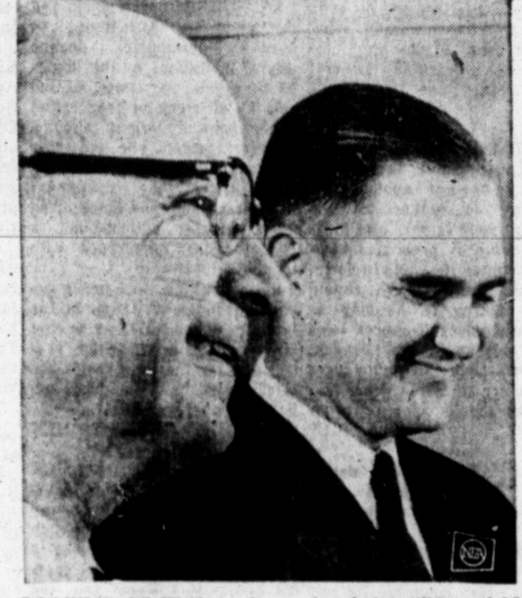
LOOKING AS IF they plan to break into "Me and My Shadow," Lester Maddox, left, and Howard Callaway turned up in Atlanta to meet with Georgia Gov. Carl Sanders to discuss the state's budget for the next two years.

Temperatures Sunday were generally warm. The state's high reading was 81 degrees at Brownsville and Laredo.