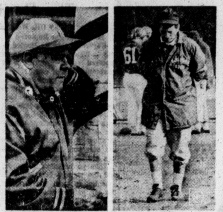
MISERY HAS COMPANY in New York where the Jets' Weeb Ewbank, left, and Giants' Allie Sherman have been experiencing difficult times lately. The Giants are last in the National League's Eastern Division while the Jets have lost three in a row, dropping out of first place in the AFL East.