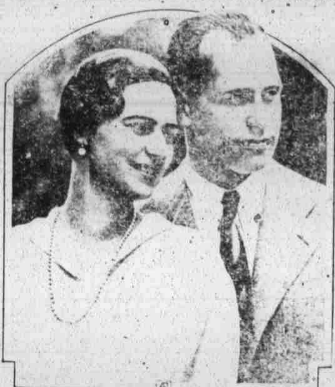
Princess Ileana of Rumania and Archduke Anton of Austria are to be married July 28 in an elaborate ceremony at Bucharest, Rumania.