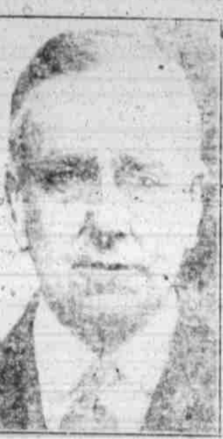
Frederic M. Sackett, United States ambassador to Germany, of the 1931 athletic carnival at Danville, Ky. She President Hoover's war debt plan with a plan ever during social activities.