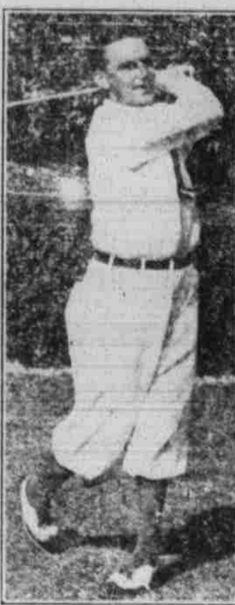
Billie Burke (above), Greenwich, Conn., professional, won the United States open golf championship, defeating George Von Elm in the second 36-hole play-off of a record-breaking marathon at Toledo.