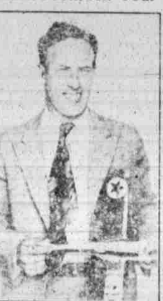
In Birmingham a cross his three months' air tour of Europe, Capt. Frank Hawks flew from Montreal to New York, 950 miles, in an hour and 45 minutes. Picture was taken in New York.