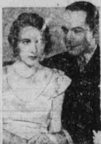
William Haines, cocky gentleman of the screen is thrown in highly complicated situations with pretty Irene Purcell as his leading lady in "Just a Gigolo" at the Ritz today, Monday and Tuesday.

"Just A Gigolo," Metro-Goldwyn-Mayer's filmization of the Helms stage hit, "Dancing Partner," with the irrepressible William Haines masquerading as a gigolo in a European summer resort, is the new attraction which opens today at the Ritz theater for a three day stand.