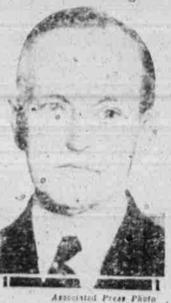
A recent picture of Calvin Coolidge, former President of the United States.