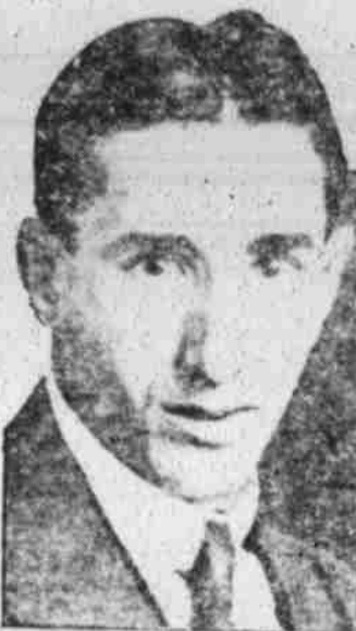
Angel Pestana, secretary general of the confederation of labor in Spain.