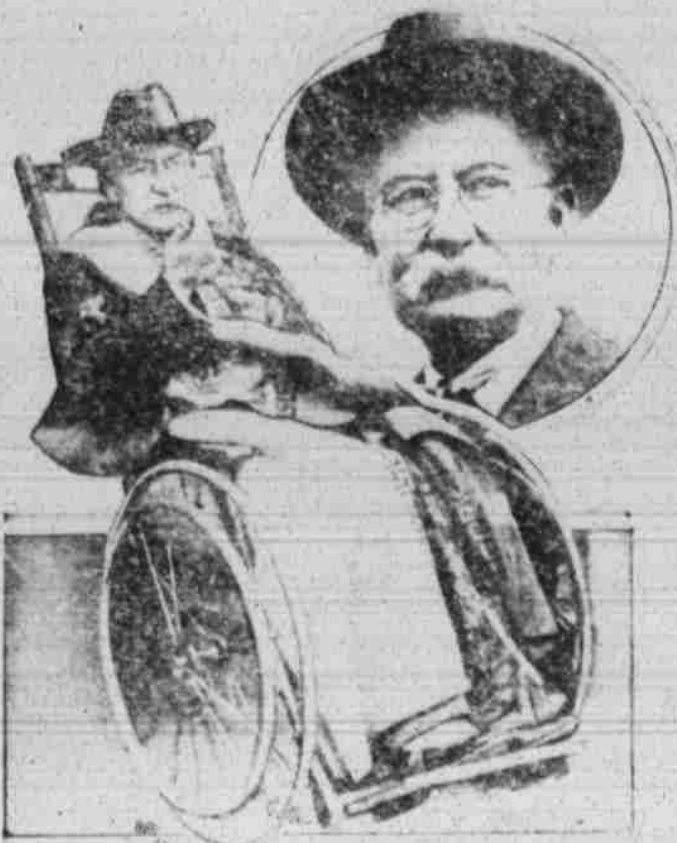
Convinced that Albert B. Fall, ex-Secretary of the Interior, is probably to serve a year of imprisonment, Fall, shown here in two poses, was convicted of bribery in connection with the leasing of public lands. He recently was examined by army physicians after it had been assumed he was too ill to serve his term.