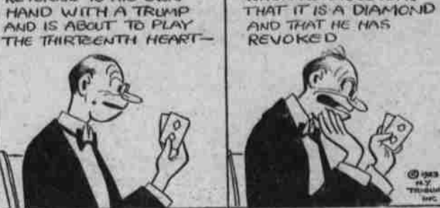
PENALTY FOR REVOKING