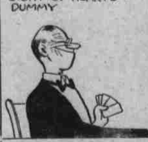
WHEN HE DISCOVERS THAT IT IS A DIAMOND AND THAT HE HAS REVOKED