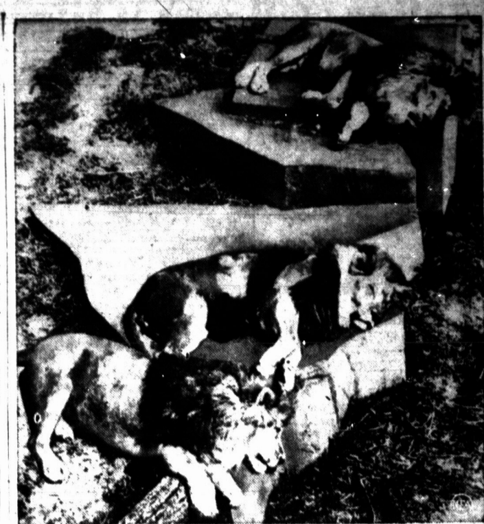
LAZY LIONS LOAF AND LIKE IT—A warm, balmy sun and a couple of comfy rocks to stretch out on—worn, but how could any lion want? These three tawny terrors are apparently afflicted with a case of galloping spring fever. So they stretch out at Chicago's Brookfield Zoo, and enjoy a little cat nap.

In fact, during the past several months samples selected from various points in the system and sent to the State Health Department at Austin for bacteriological