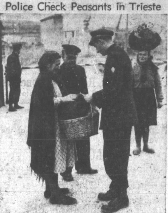
Police Check Peasants in Trieste Long-time trouble spot in Europe, Trieste is once more the center of international wrangling. Police at a road block between Trieste and Capodistria check the bundles of peasant women before allowing them to cross the frontier.

SYSTEM (Continued from Page 1) parts of the city fire protection is inadequate. Rapid growth of the city, as well as its great expansion, is the cause of the present inadequacy, said the mayor. Six areas of the city need new lines immediately as well as additional fire hydrants, said the Commissioner. They are the Finley-Banks Addition, Alexander and Gordon Addition on E. Francis. Area in the west side of town south of Alcock. Area north of the high school. Low pressure areas in the present system should be remedied by increasing the size of the lines and by tying all deadend mains to other existing mains. Also, it will be necessary to provide a large main to a new elevated storage tank. Commissioners believe these extensions will provide adequate fire protection and good working pressures throughout the city.