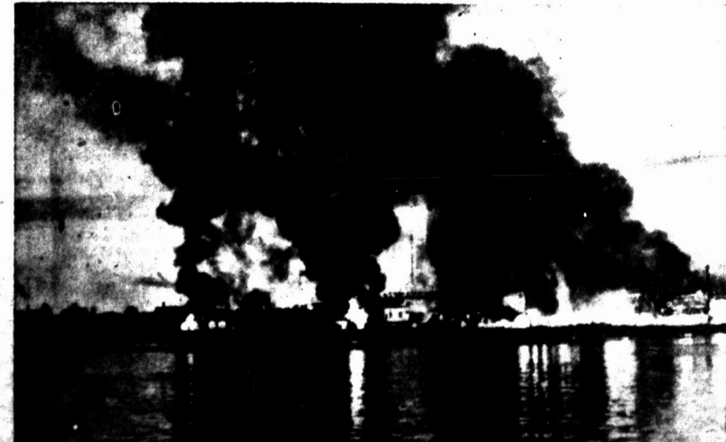
FIRE SWEEPS THROUGH LUMBER YARD—A fire that started in a lumber yard in Bridgeport, Conn., as a blaze almost destroys the area. Damage to buildings, lumber and fabricated homes was estimated at one million dollars.

If it's in the hardware equipment line see Lewis Hardware—adv.