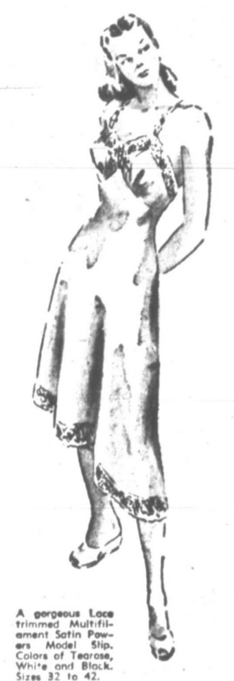
A gorgeous lace trimmed Multifilament Satin Powers Model Slip. Colors of Tealose, White and Black. Sizes 32 to 42. $1.79