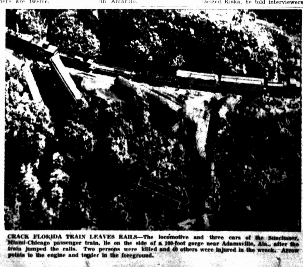
CRACK FLORIDA TRAIN LEAVES RAILS—The locomotive and three cars of the Suncoast, Miami-Chicago passenger train, lie on the side of a 100-foot gorge near Adamsville, Ala., after the train jumped the rails. Two persons were killed and 40 others were injured in the wreck. Arrow points to the engine and tugger in the foreground.

SAN FRANCISCO—(AP)—Alaska's Governor Ernest Gruening says a maybe Soviet aircraft have flown over Alaska recently—but he doesn't believe it. They don't need to, he adds; Russia already knows "everything we have there."