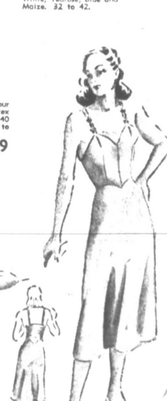
Lovely soft Rayon Crepe Slip in tailored style. Four gore model. Fitted waist and full flare skirt. New 39 inch length. 32 to 44. $2.79