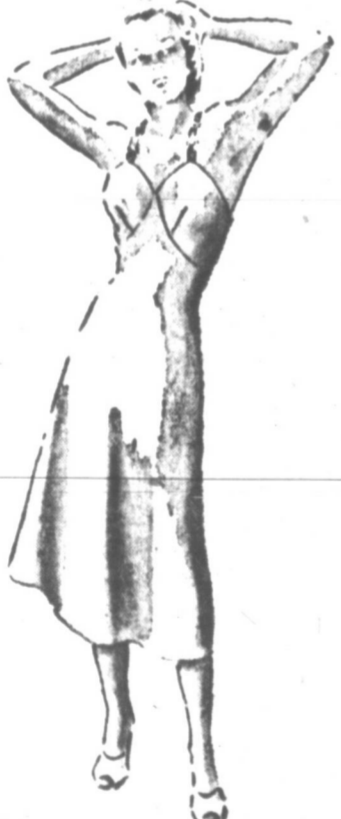
Sweetheart Multifilament Rayon Satin half slip. Two inch lace trimmed kick pleats in front. Full sweep type. Elastic waist band. White Tealose Blue. S, M, L. $2.79