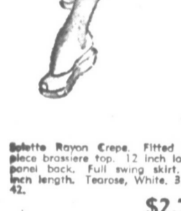
Belleite Rayon Crepe. Fitted four piece braisiere top. 12 inch loyter panel back. Full swing skirt. 40 inch length. Tealose, White. 32 to 42. $2.79