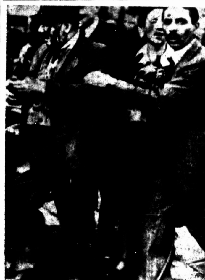
CASUALTY IN MILAN RIOT—With blood streaming down his face, an injured demonstrator is led away by friends during the first mass violence since the Communists were defeated in the Italian elections last week. Milan, Italy's largest industrial city, was threatened by a general strike after this riot.

VOL. 47—NO. 18 (8 Pages) PAMPA, TEXAS, WEDNESDAY, APRIL 28, 1948 Price 5c AP Leased Wire