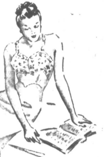
A Powers Model featuring the new wide lace Bra top and skirt trim. Multifilament Crepe. Fitted waist. 40 in. Length. Full sweep skirt. White, Tealose, Blue and Moize. 32 to 42. $3.79

It's been years since you have seen so many lovely slips in one store. Styling has never been lovelier, quality has never been higher. Each model sketch is from Anthony's huge stock of the newest in slips. For Easter, Spring or Summer, we have it NOW! And please note the low prices.