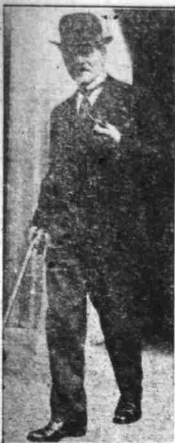
A new picture of J. Ramsay MacDonald, premier of Britain's new national government, taken following a recent visit with the king.