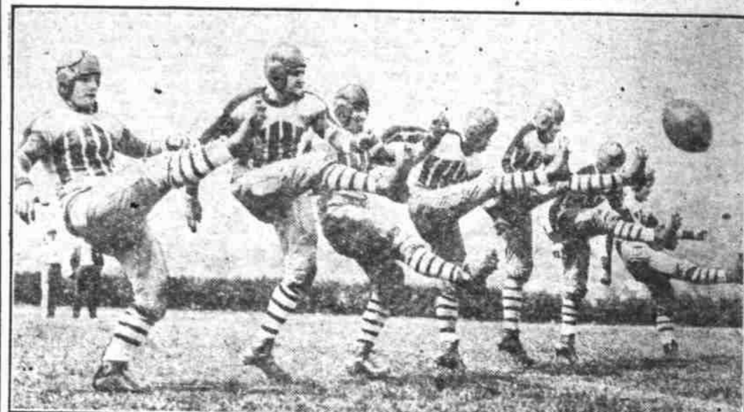
Here's some activity on the eastern football front—Columbia university backfield candidates limbering up their leg muscles and educating their toes in punting practice.