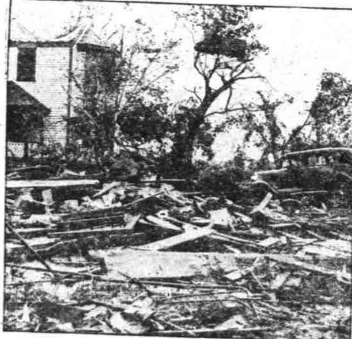
Above is a scene typical of the destruction spread by a cyclone which swept through Eureka, Mo., injuring three persons. The roof wreckage of its garage. Part of a tin roof is wrapped about the tree in center.