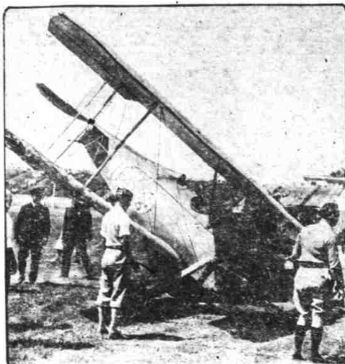
This is what happened when C. Shirley Reitzel of Akron, O., cracked-up in the dead stick landing contest at the national air races at Cleveland. Although the plane was badly damaged, Reitzel suffered only minor injuries.