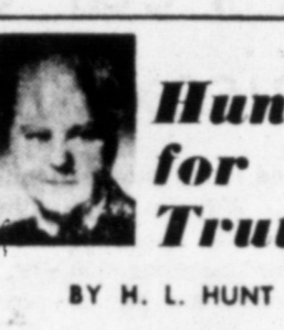
BY H. L. HUNT

SPARKS — One of the Secret Servicemen regularly assigned to Vice President Hubert Humphrey is a Negro. He accompanies him on trips throughout the country . . . The National