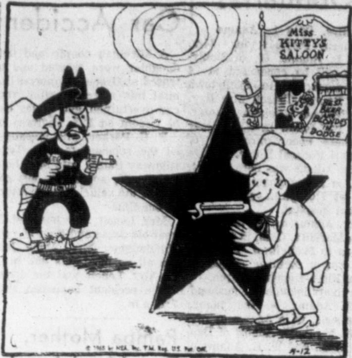
"You're a pretty brave man behind that badge, Marshal!"