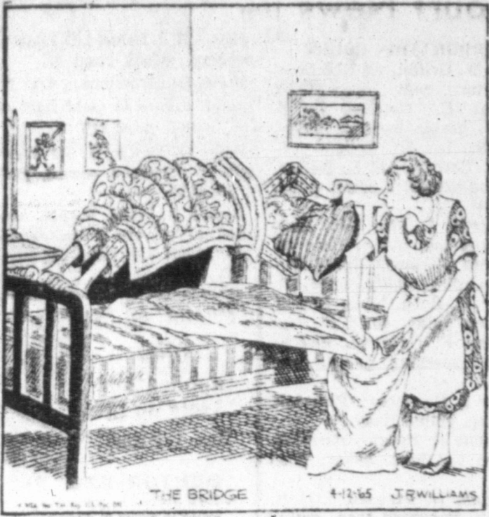
THE BRIDGE 4-12-65 J.R. WILLIAMS