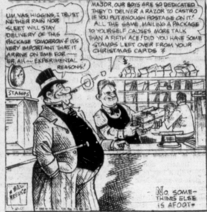
NO SOMETHING ELSE IS AFOOT!