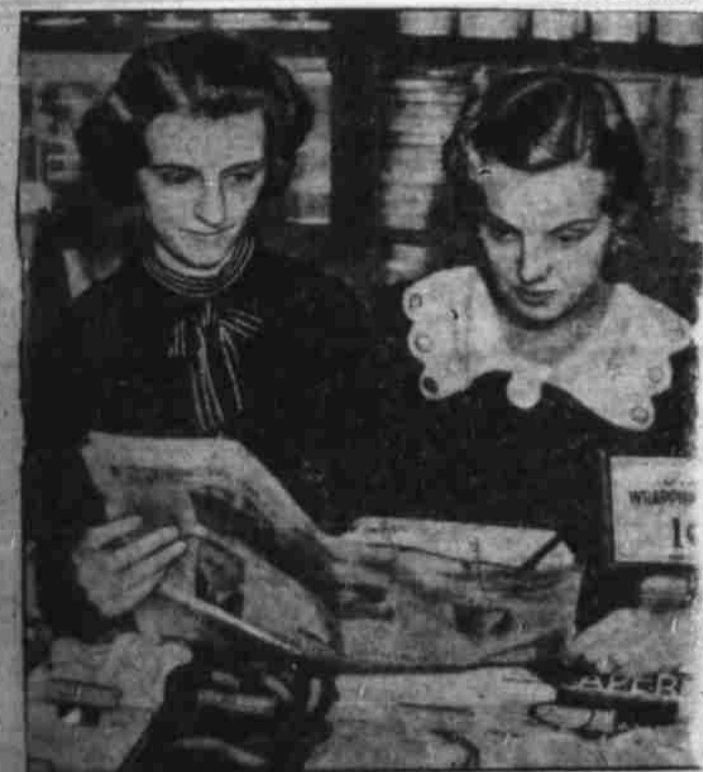
Two of the "five and ten" strikers in a Detroit Woolworth completely ignored customers and the management to follow the account of their sit-down in a local paper, atop the display counter in the ribbon department. They are part of the 100 girls who staged a sit-down strike.