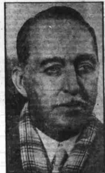
The bite of a black widow spider during filming of "The Lives of a Bengal Lancer" several years ago, was believed by friends of Sir Guy Standing (above), to have been the indirect cause of the famous British actor's sudden death from heart disease.