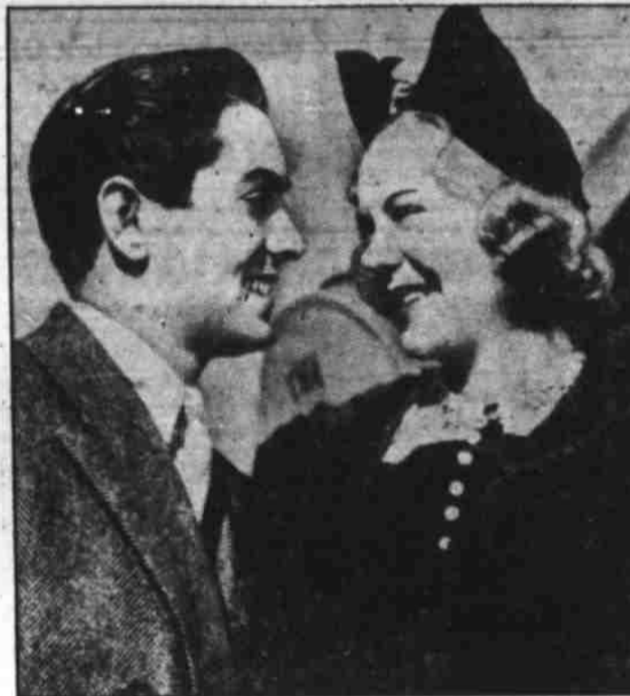
An icy "ridiculous" was the retort of Sonja Henie when asked if her interruption of a tour for a flying visit to Hollywood was made to "check up" on another reported romance of Tyrone Power, young film actor. Here's Power showing his devotion to the skating champion and actress on her arrival.