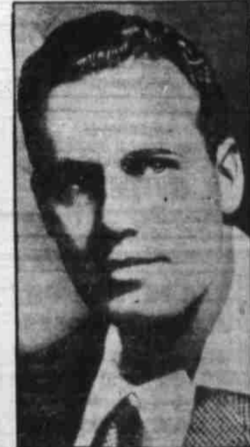
When the 1937 baseball season ends, Wesley Ferrell (above), Boston Red Sox pitcher, plans a crack at Hollywood, a copy-righted story in the Greensboro, N. C., Daily News says. Ferrell is shown as he mused on the report that a film executive friend is beckoning him to California.