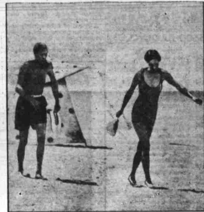
Reports that the Duke of Windsor will wed Mrs. Wallis Simpson May 2 caused fear throughout the British empire that their romance would overshadow the coronation of his brother-successor just 10 days later. Edward and Mrs. Simpson are shown on the beach at Biarritz in the summer of 1934 in this previously unpublished picture.