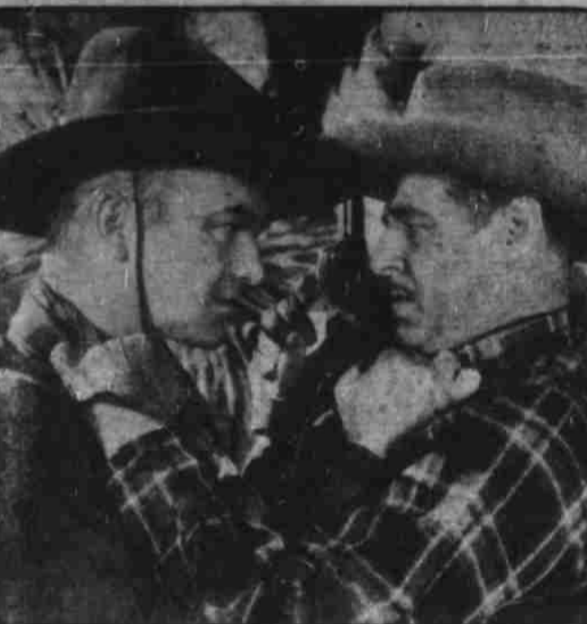
William Boyd appears again as the doughty Hopalong Cassidy, in a western adventure melodrama, "Borderland" which plays Friday at the