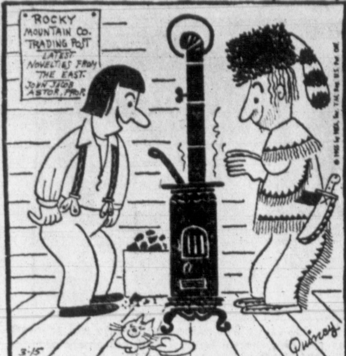
It was a pot-bellied stove—but the new low-caloric coal fixed that!