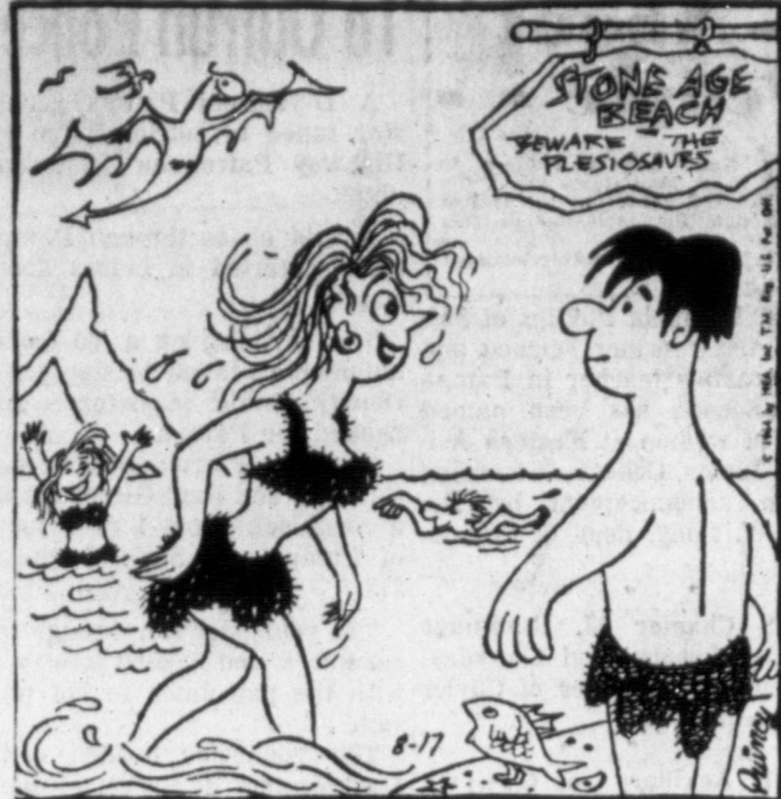
"I'm glad the topless bathing suit went out of style! It was terribly old-fashioned!"