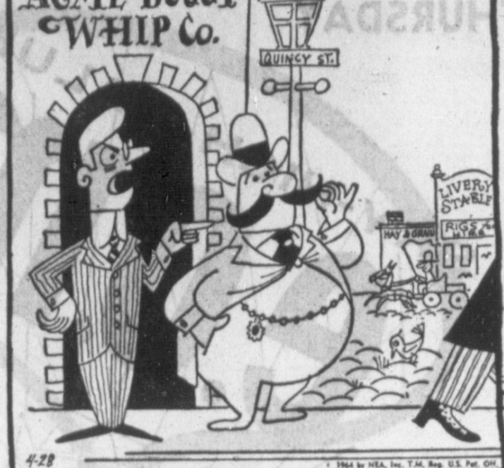
"What's with young Henry Ford there? He laughs in my face whenever he passes by the office!"