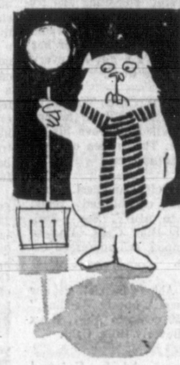
CHARLEY GROUNDHOG ... how right can you be?

MIAMI (UPI) — Four Cuban fishing boats, flanked by U.S. Coast Guard cutters, headed to Key West today where a battery of federal agents waited to question the crews. The boats, containing approximately 50 Cuban crew members were boarded and searched by Coast Guard boarding parties Sunday night when they entered U. S. waters. U. S. officers ordered the boats to remain at anchor for most of the night and shortly before dawn instructions were radioed to bring the boats to the Coast Guard station at Key West.