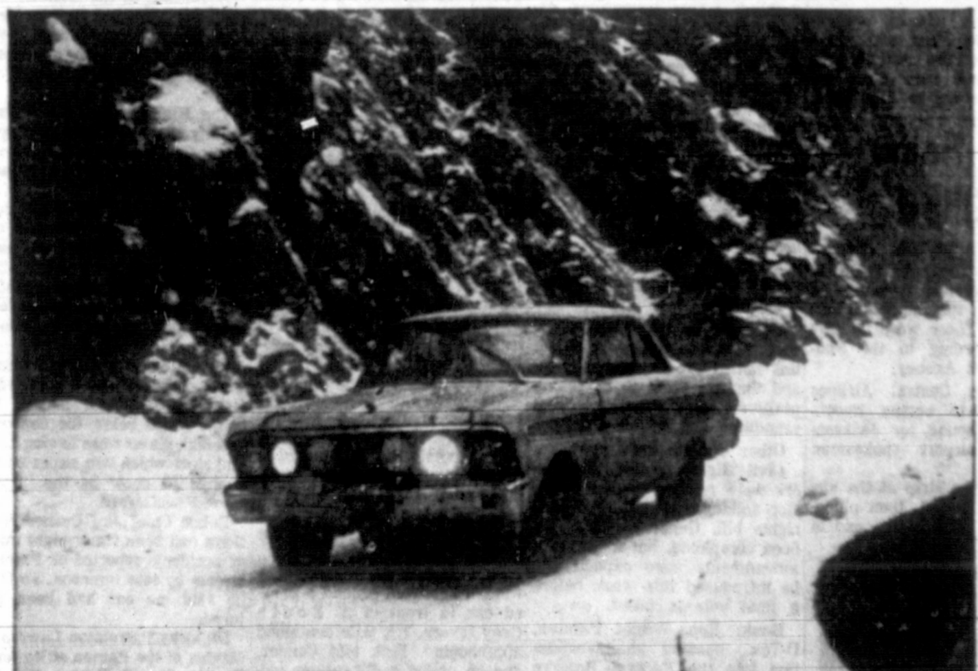
Four Falcons started from Oslo, four from Paris, on routes calculated to be equal in difficulty and length. Weather conditions varied from clear, bitter cold through freezing fog to blinding snow—and the time schedules made no provision for delays. Here a Falcon swirls through a sudden snow shower, testing traction in a practice run.

Falcon entered two classes in Europe's 2,700-mile winter ordeal—won them both and finished 2nd overall out of 299 cars. That's durability!