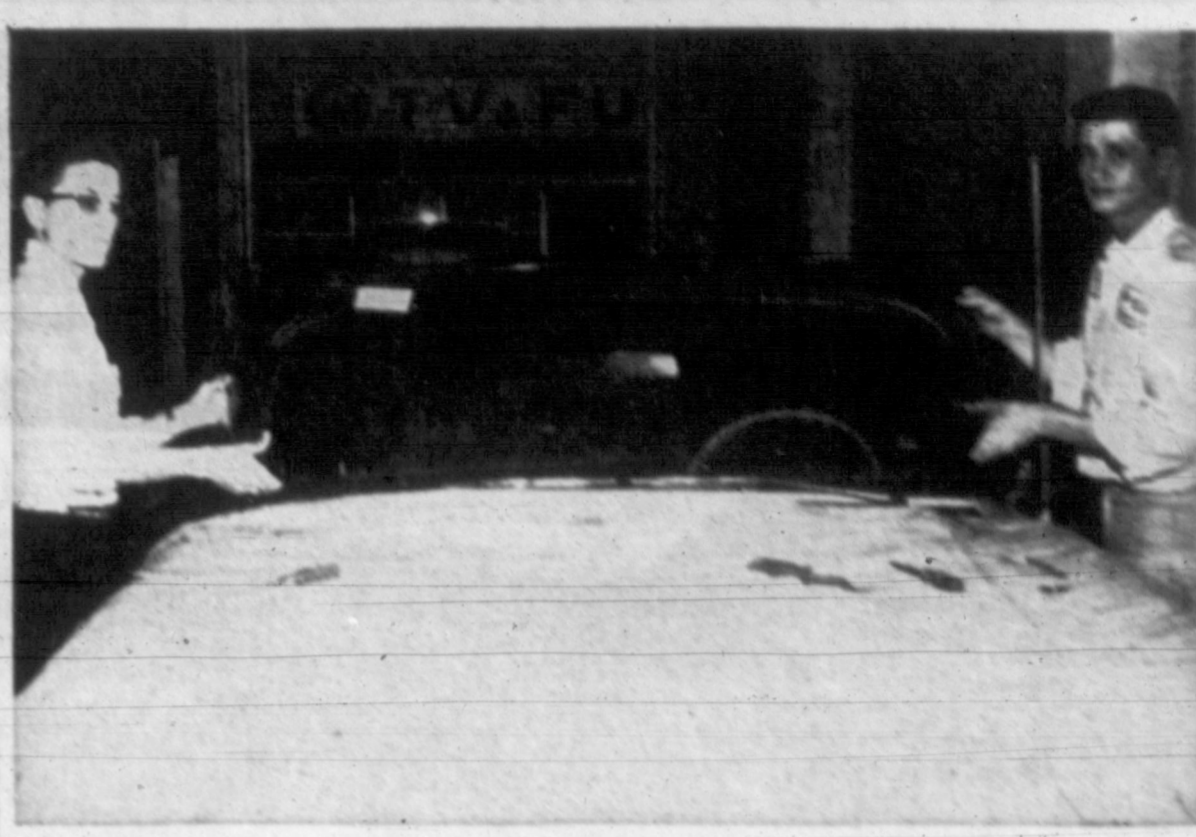
INSTALLING WINDSHIELD—Ross Pool, left, and Bill Edmiston are shown fulfilling a customer's needs at Pittsburgh Plate Glass, 112 N. Somerville in Pampa.