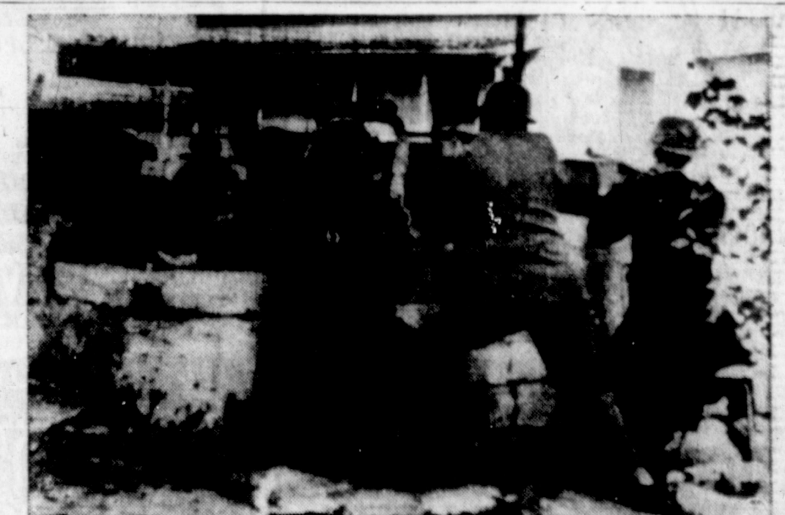
NEW ATTACKS — Steel-helmeted Greek Cypriot police return fire during a battle with Turkish Cypriots at the Papho police station in Nicosia, Cyprus, Government sources said new attacks by the Turkish Cypriots broke a cease-fire agreement. In an attempt to end the bloody fighting, both the Turkish and Greek Cypriots have agreed to place their army units under the command of British troops.

was even less than perfunctory. The President then called in The House scheduled a simi- Secretary of State Dean Rusk, larly abbreviated session three Agriculture Secretary Orville Freeman and other advisers for Union appeared today to be store we have it. Lewis Hdwe. ranch with West German Chan-(Adv.) cellor Ludwig Erhard.