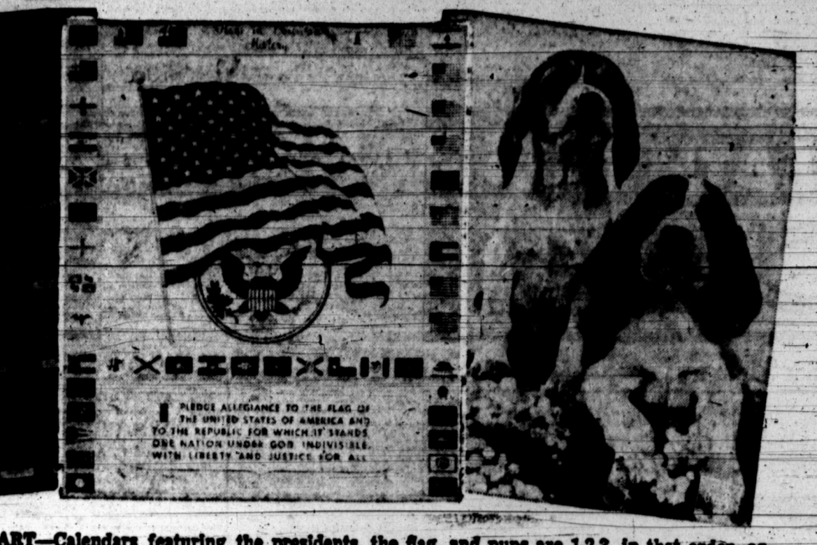
TOPS IN '63 CALENDAR ART—Calendars featuring the presidents, the flag, and pups are 1-2-3, in that order, as favorite subjects for 1963 distribution.

the place where buyers and sellers get together