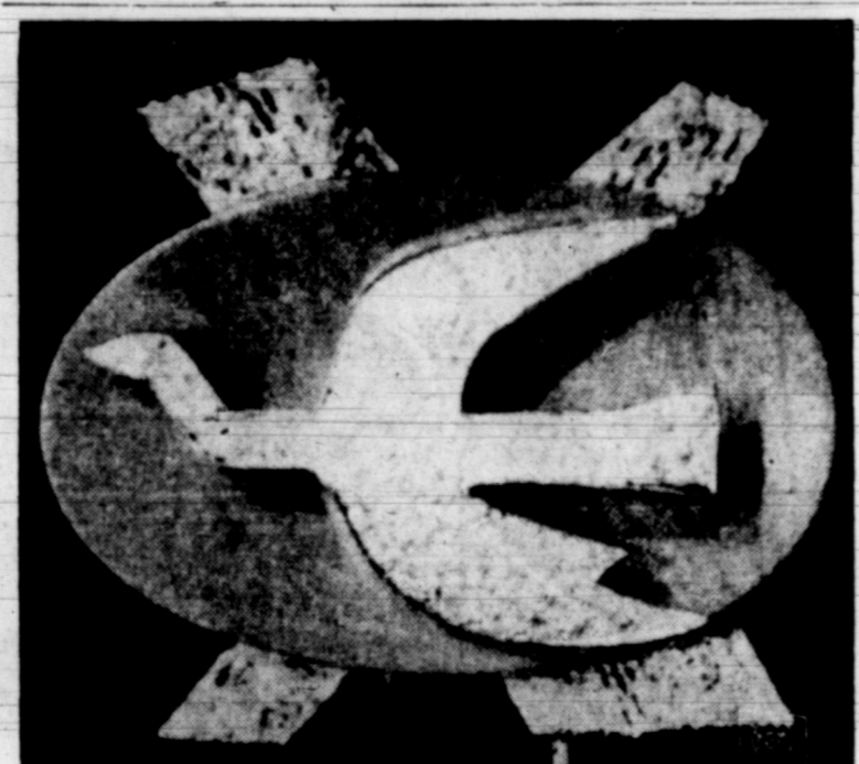
NOT FOR SQUARES —Bird of diamonds on a coral base is part of a $2 million collection on display at the Louvre, Paris. Its creator, Georges Braque, credited with origination of the art form of cubism.

AT THE SIGN OF THE CHEVRON where we take better care of your car