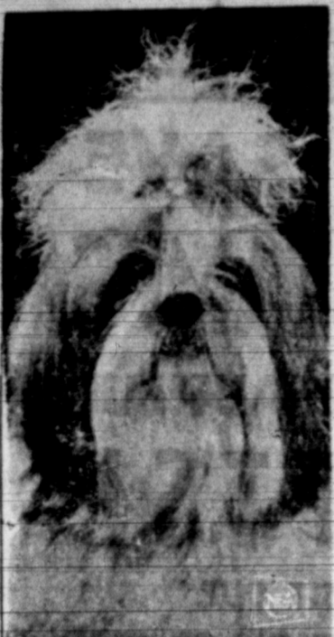
CANINE COIFFURE — Tia-Choo-Ma wore this original canine hairdo at a dog show in London, England.

Twenty-one guns constitute a presidential salute.