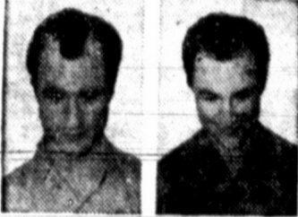
Before After See Dramatic Story on Page 2