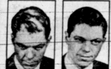
Before After See Dramatic Story on Page 2