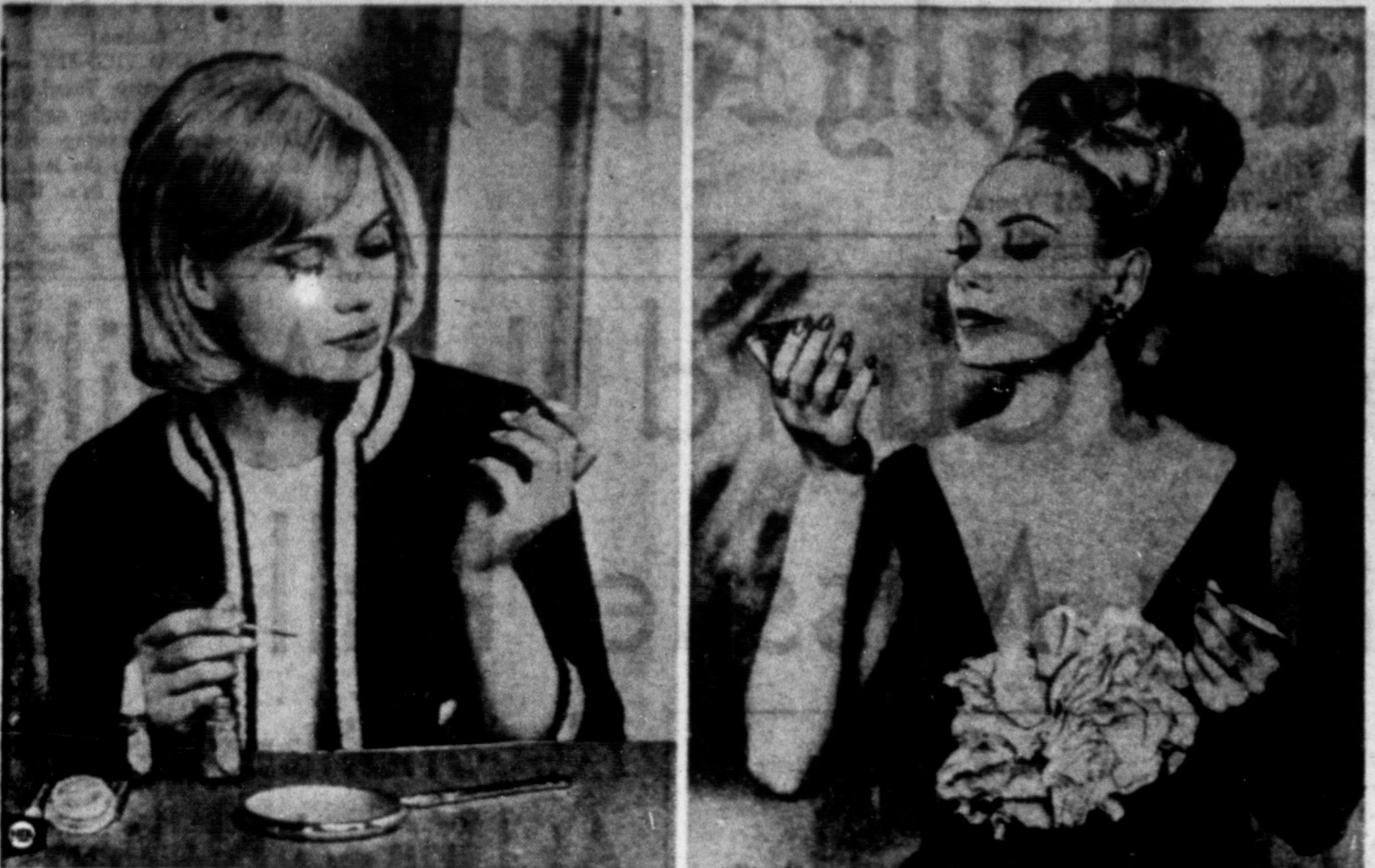
This girl knows that she should choose her lipstick and nail enamel to complement fall fashions. She wears a vibrant red hot lipstick shade to accent her black and white daytime ensemble (left), and applies matching nail enamel for the finishing touch. For evening (right), she chooses a rose, with golden overtones. The lipstick comes in a long, slender case and is a lipstick and liner combined. With this shade, she will use jade eye shadow and liner for a striking contrast, and complete the picture with matching nail enamel. She wears a light foundation and powder.