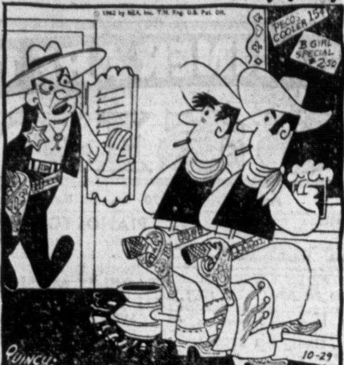
"All right—which one of you guys parked a white horse in the tow-away zone?"