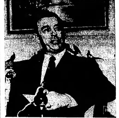
ARRESTED — Former Maj. Gen. Edwin A. Walker, shown here in his Dallas office, was arrested this morning and charged with a number of offenses, including inciting rebellion. Walker was reportedly seen this morning during the riots "egging the students on."