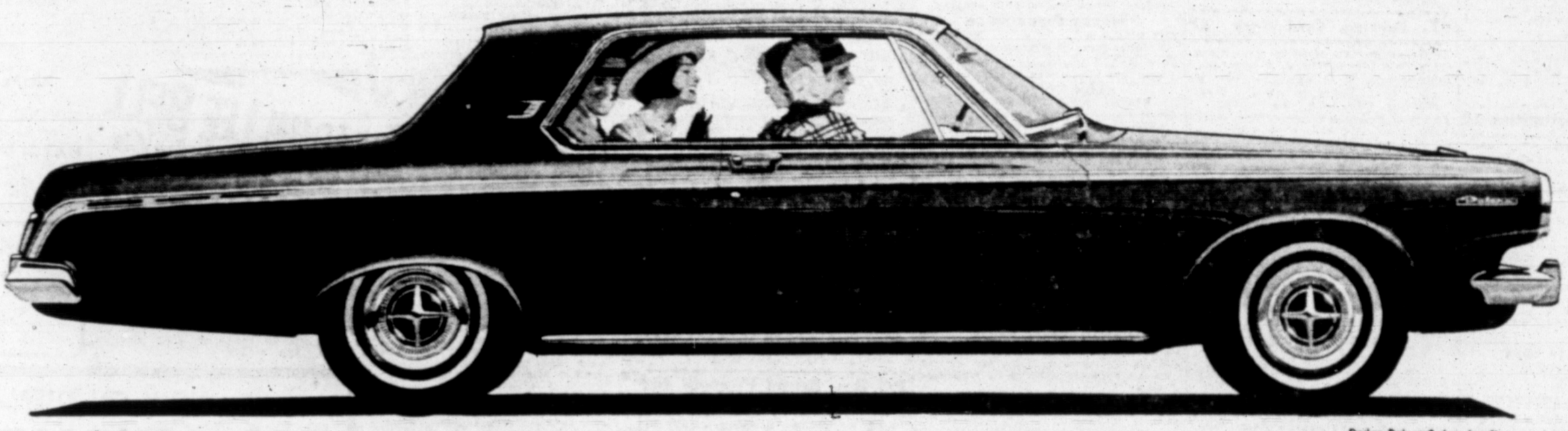
Dodge Polara 2-door hardtop

1963 DODGE... BEAUTIFUL NEW ENTRY IN THE LOW-PRICE FIELD