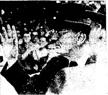
DEFIES COURT — Gov. Ross Barnett of Mississippi here acknowledges the cheers of a crowd at the main entrance to the University of Mississippi in Oxford as he arrived last week to personally deny admittance of James Meredith, a Negro, to Ole Miss despite a federal court order to let Meredith enroll. Meredith was today, however, enrolled in the school under federal marshal protection.