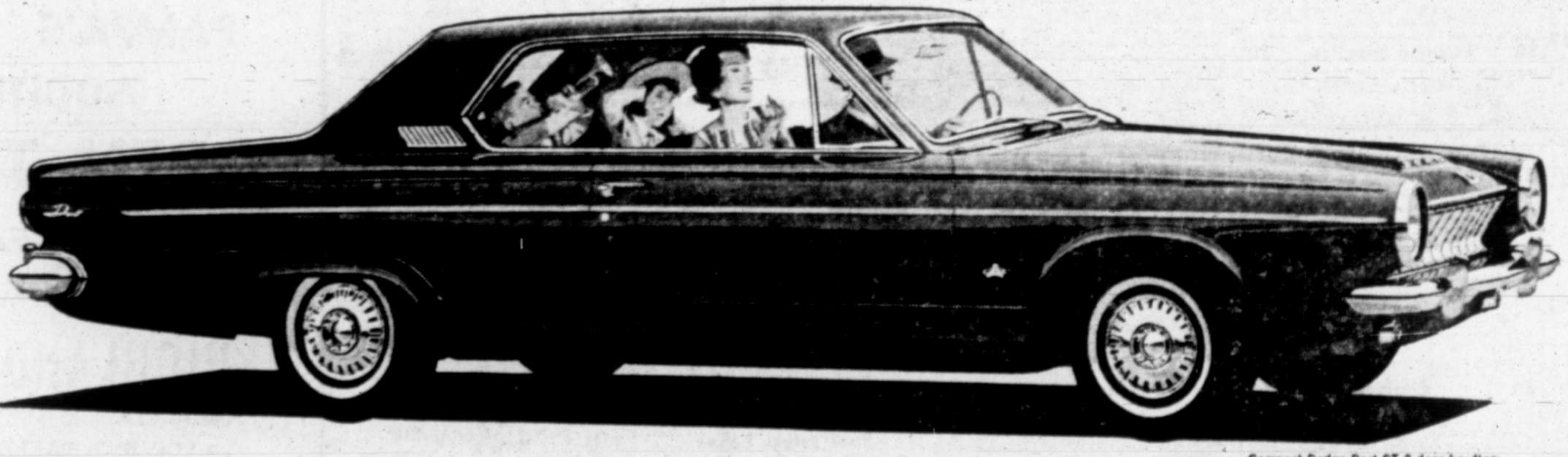
Compact Dodge Dart GT 2-door hardtop

1963 DODGE... BEAUTIFUL NEW ENTRY IN THE LOW-PRICE FIELD