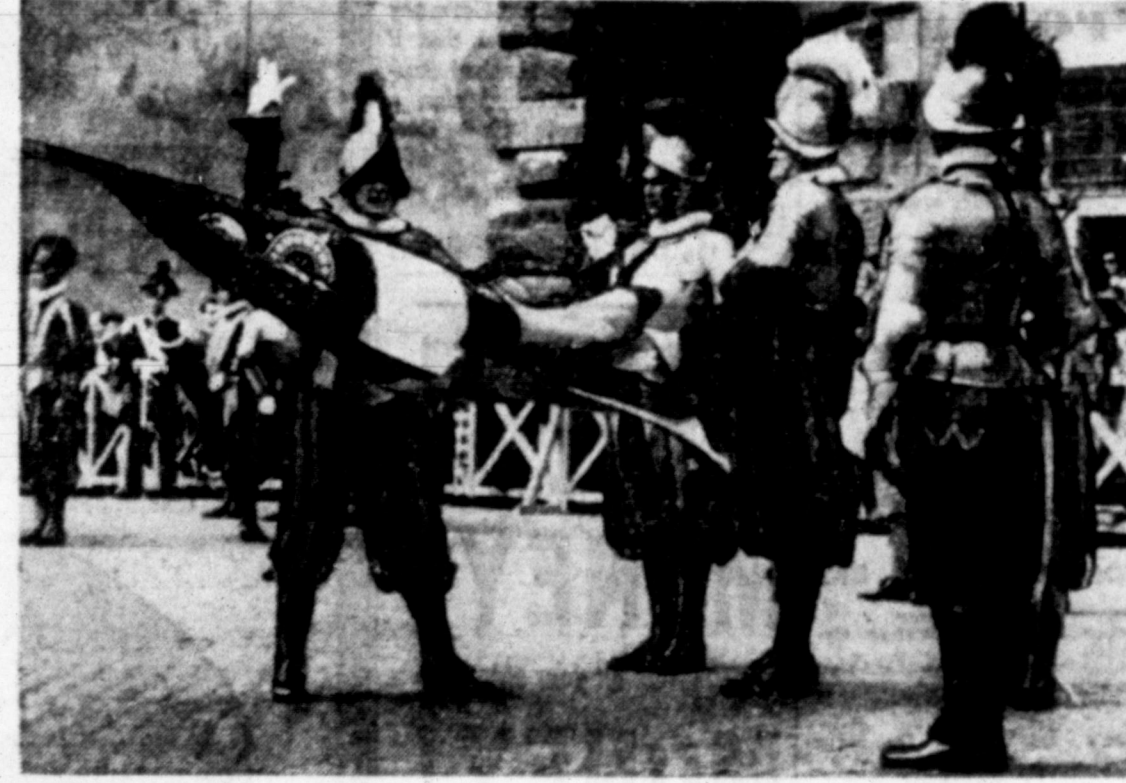
PAPAL BODYGUARDS —Raising his right hand with three fingers extended (symbolizing the Holy Trinity) and placing the other hand on the Papal Flag, a recruit of the Vatican City Swiss Guards takes his oath of allegiance to the Pope in St. Damasus courtyard.