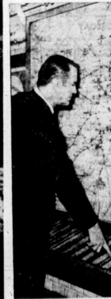
PRESSING BUSINESS —Automation has taken over the job of dispensing travel information in the Paris Metro (subway system). Even the non-French speaking travelers can know where they are going with a press of the button. The route lights up on the map.