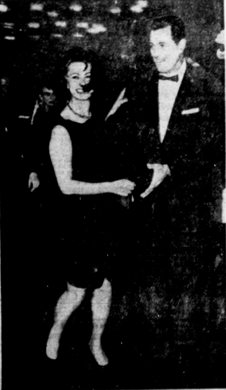
ROCK WITH ROCK —Skirts swinging and tresses bouncing, Italian actress Sophia Loren gets a lesson in American style rock 'n' roll from American star Rock Hudson in Bamberg, West Germany. She wouldn't try the Twist.