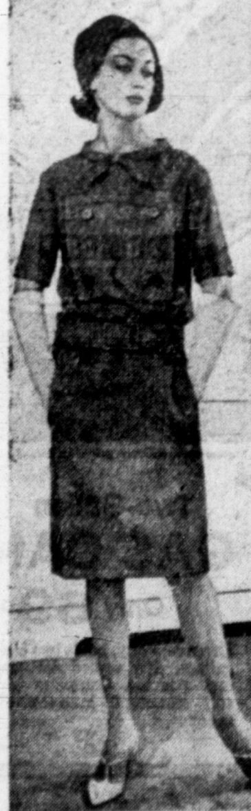
SQUARE DEAL —Dior conceals the waistline by dropping the belt to the hip in this green dress from Paris. The school-girl uniform look is accomplished with double-breasted detail at the front and the tie-tie.