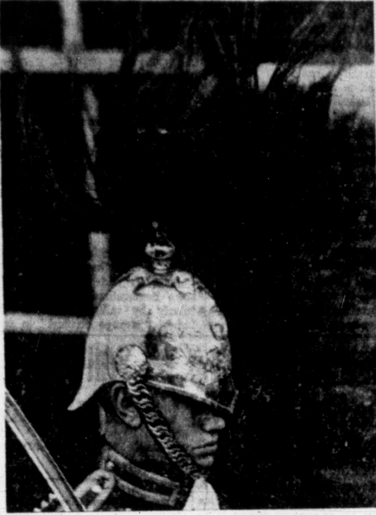
STRIP TEASE —Strong winds provide an upswept hairdo for this member of the Royal Horse Guards in London. The plume was lifted by steady stiff breezes, revealing the fancy helmet usually hidden by the long hair-like top piece.