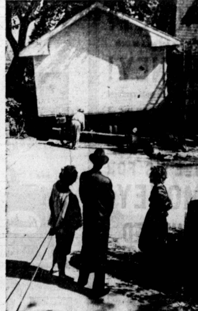
SQUEEZE PLAY —There's a tight squeeze as workmen ease a garage between a house and a tree in Topeka, Kan. The house stood firm and so did the tree; the garage gave in a little, as it made its first trip down the driveway.