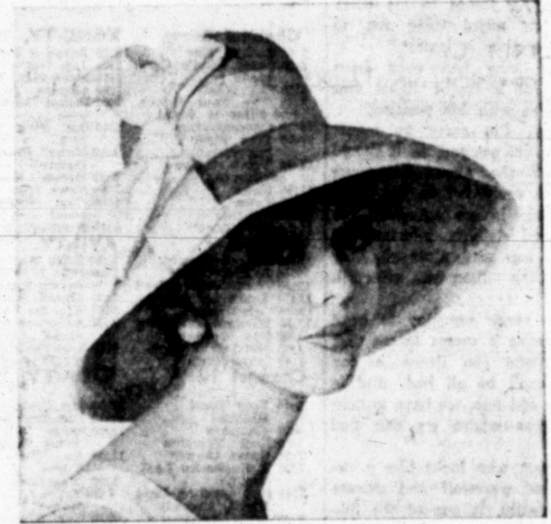
SUMMER SUNBRELLA —Shaded glamor comes to town with this robin's egg blue straw frosted with white grosgrain banding and bow. The fashionable hat also shields the face from the sun with practical chic.