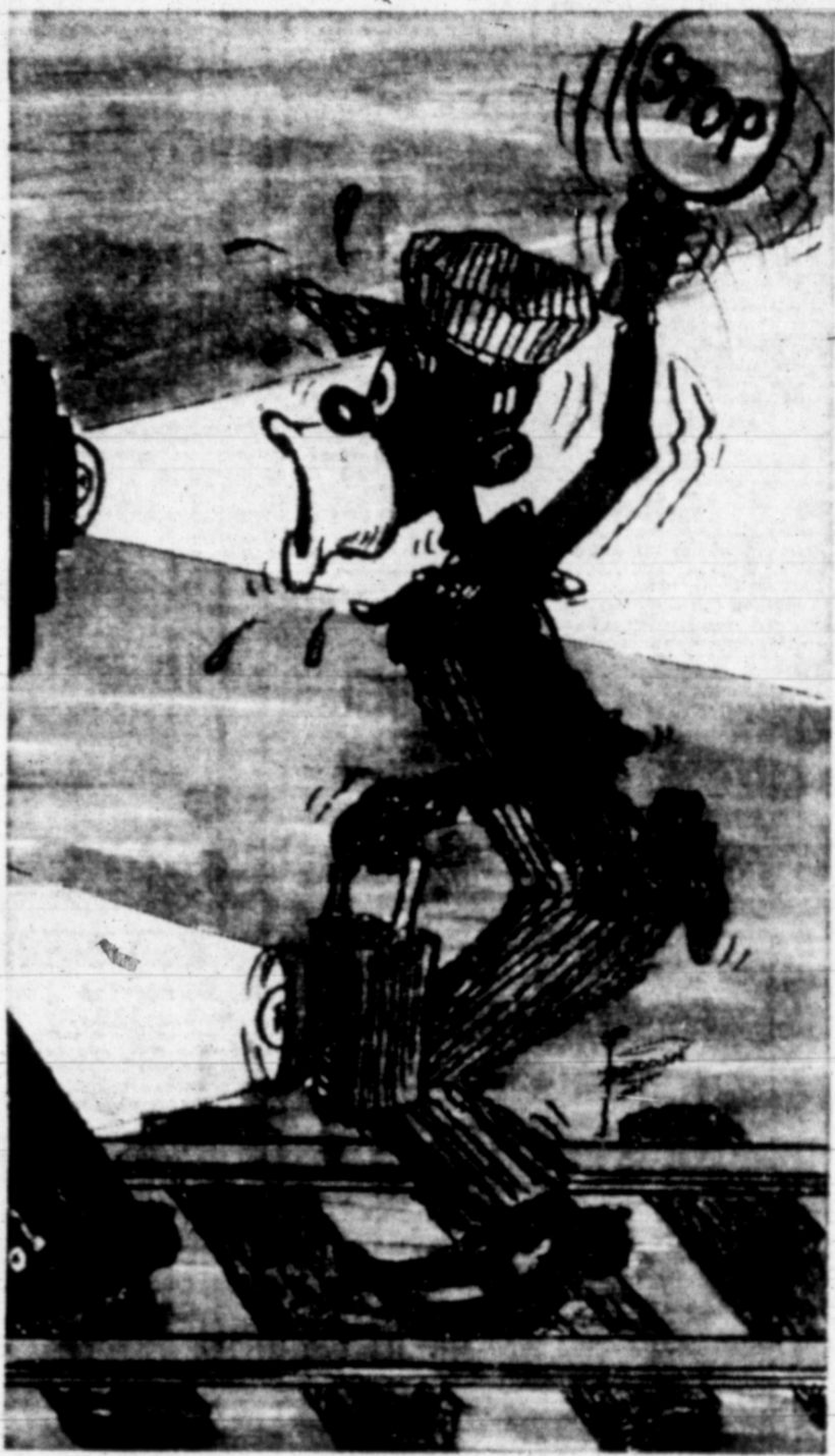
"WHOA DAR" This here is Pampa — A whole car load of refrigerators goes to C & M TV & Furniture "I Said Whoa"

ICE MAKER Available in this Refrigerator - Freezer For Only $80.00 More — See It.