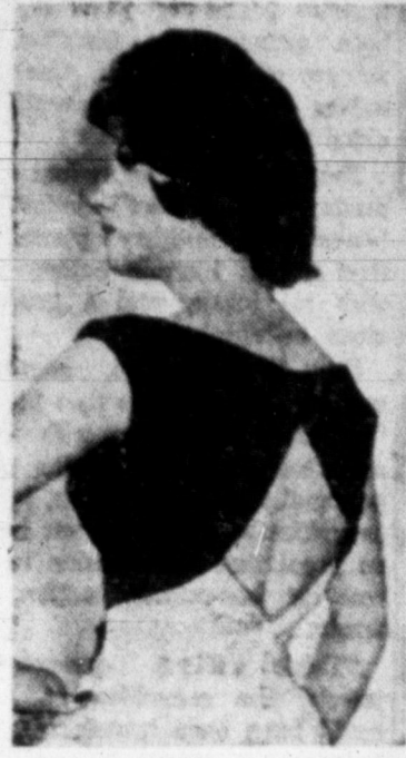
BACK TALK —The back steps to the fore in this fall-winter costume from New York. The design shapes a large cutout between the shimmering white and silver matelasse dress and the brief black velvet top with a keyhole.