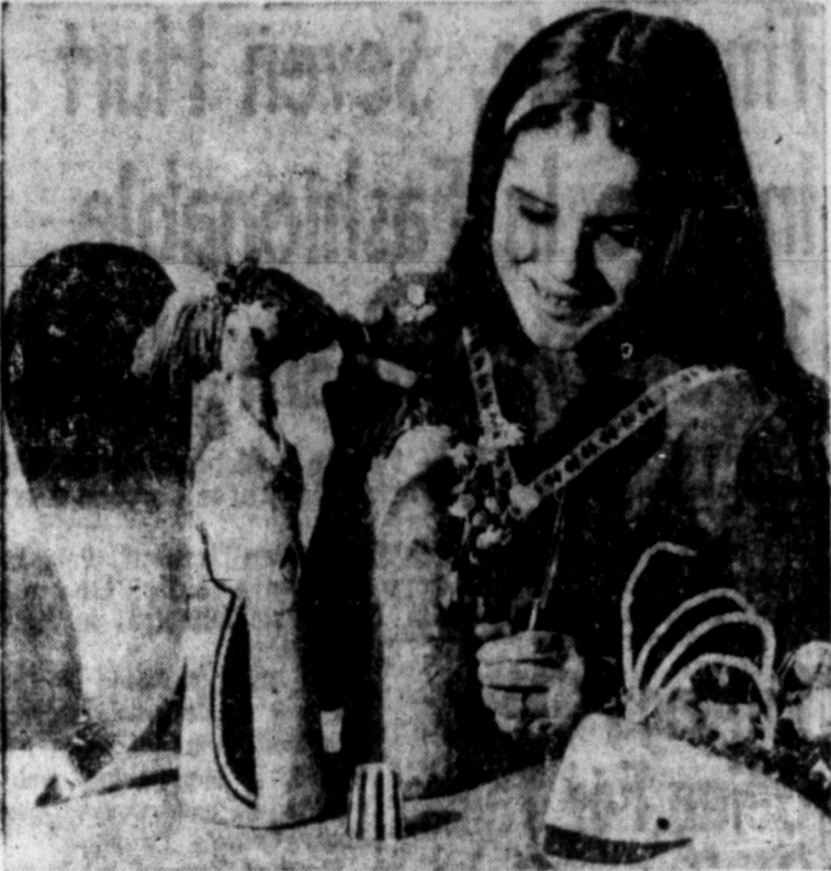
Leftover scraps of bright gift papers, ribbons and fabric decorate blue plastic bottles to make a wistful angel, a flower girl and a smiling whale.