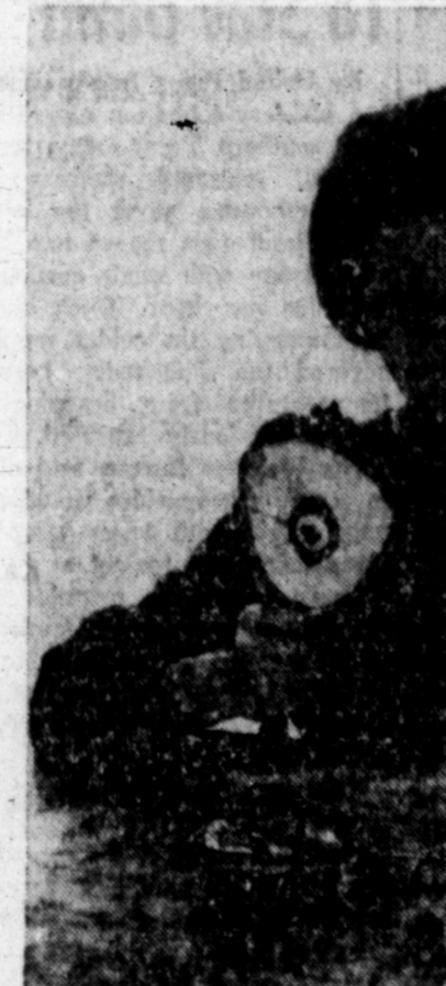
The teen-ager who wants to face the coming year with confidence will do something about skin blemishes. This teen-ager uses medicated pads to help clear up minor blemishes.

No, young people today don't need to be told to be practical about choosing a mate. They're pathetically practical, already. Maybe that's one reason why so many of their marriages aren't lasting. Those who "shop around" for a husband or wife instead of marrying only because they are so head over heels in love they are